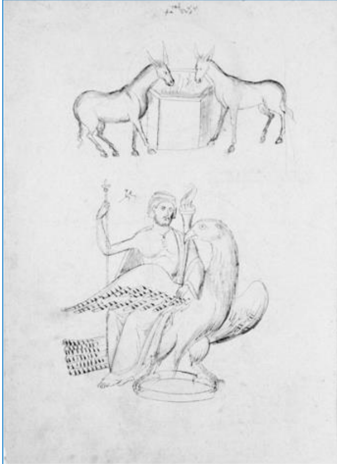
Figure 2 Donkeys at the Manger, Jupiter sitting on the Eagle, Rome, Biblioteca Vaticana, Cod. Vat. gr. 1087, fol. 302v.

original). 9 In the representation of Hercules, the tree of the Hesperides is omitted in order to exclude allusions to the pagan myth. Likewise, the representation of Virgo doesn't have scales in order to avoid an identification with the goddess Dike/Iustitia.