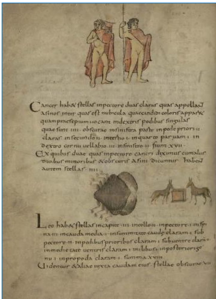
Figure 1 Gemini, Cancer and Donkeys at the Manger; Madrid, Biblioteca Nacional, Ms. 3307, fol. 56v.