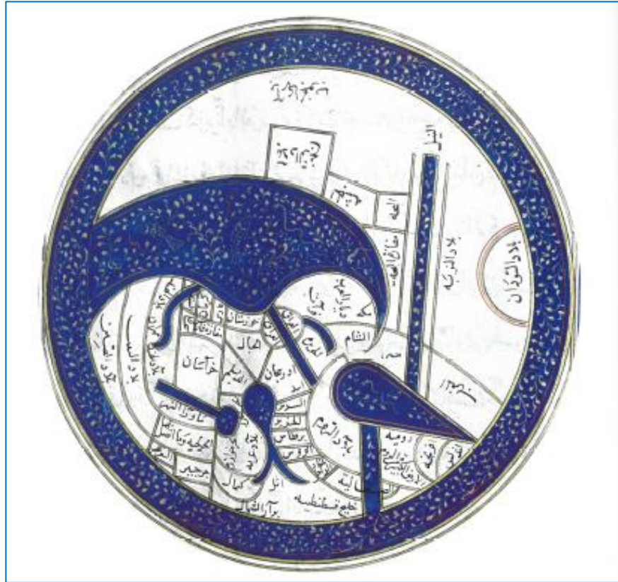
Figure 2 Close-up view of Aqqoyunlu KMMS Map from al-Istakhri's Kitab al-masalik wa-al-mamalik ( Book of Routes and Realms ). Ottoman Empire, Turkey, c. mid-late 15 th century. Topkapi Saray Museum, Istanbul. Ahmet 2830, fol. 4a.

cartographic representation, which Pinto traces in Timurid, Aqqoyunlu, and Ottoman KMMS maps. This detailed analysis serves Pinto's effort to illustrate the use of cartography as a tool of historiographical revision (see esp. pp. 214-217).