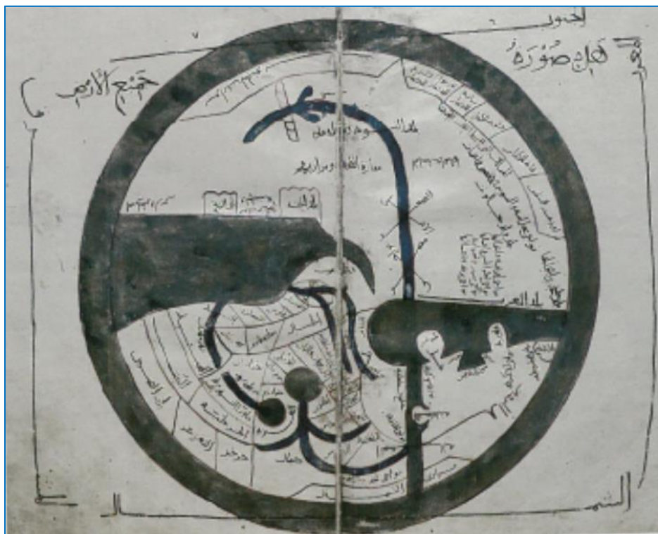
Figure 1 Earliest extant KMMS world map from Ibn Hawqal's Kitab surat al-ard ( Book of the Image of the World ), 1086, Iraq. Topkapi Saray Museum, Istanbul. Ahmet 3346, fols. 3b-4a.

epistemological perspective and in some decorative aspects. Some chapters draw on Pinto's own earlier publications and her Ph.D. dissertation.