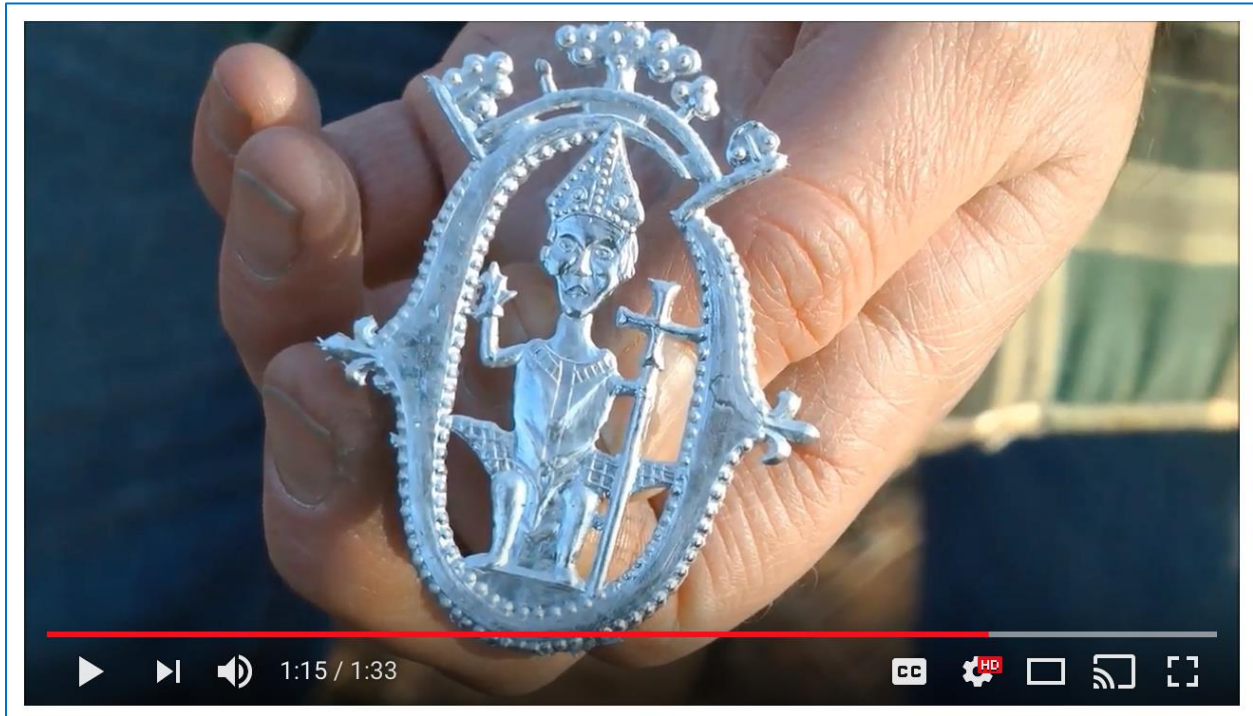
Figure 1 Screenshot of the Youtube video, “Making a Medieval Pilgrim Badge.”

medieval badges' production drives home their potential for mass production and their simple, sparkling beauty when freshly cast.