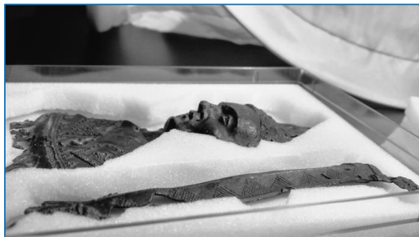
Figure 3 Badge of Thomas Becket's Head Reliquary.