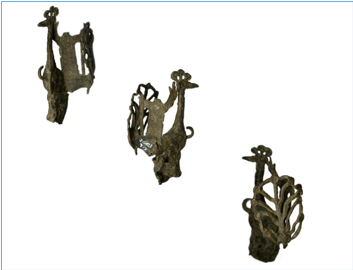
Figure 4 Pilgrim souvenir of Thomas Becket atop a peacock.

Our colleagues at the University of Kent have projected a 3D model of a Thomas Becket Ampulla onto the wall of a seminar room and interacted with it to discuss the cult of saints in medieval England. One of the students from the group, Lucy Splarn, then focused her final year dissertation on an almost entirely unpublished pilgrim souvenir showing Thomas Becket atop a peacock. As an example of in-the-round micro-sculpture, it resists helpful 2D reproduction.