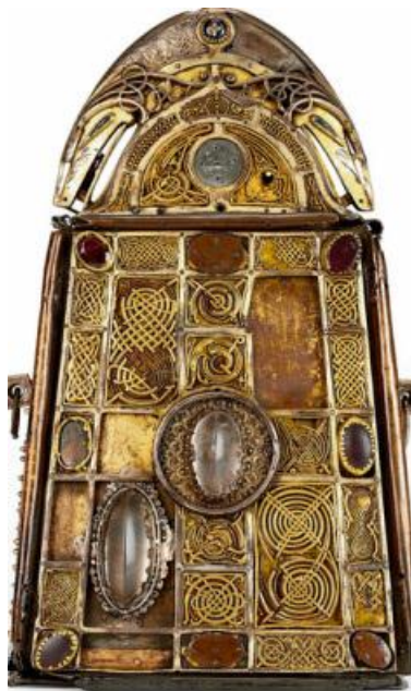
Shrine of St. Patrick's Bell, 1094-1105, Armagh.

Chapter five, Bells Relic and the Monastic Voice , examines the role and function of medieval bell relics and reliquaries. The author provides an interesting discussion of the