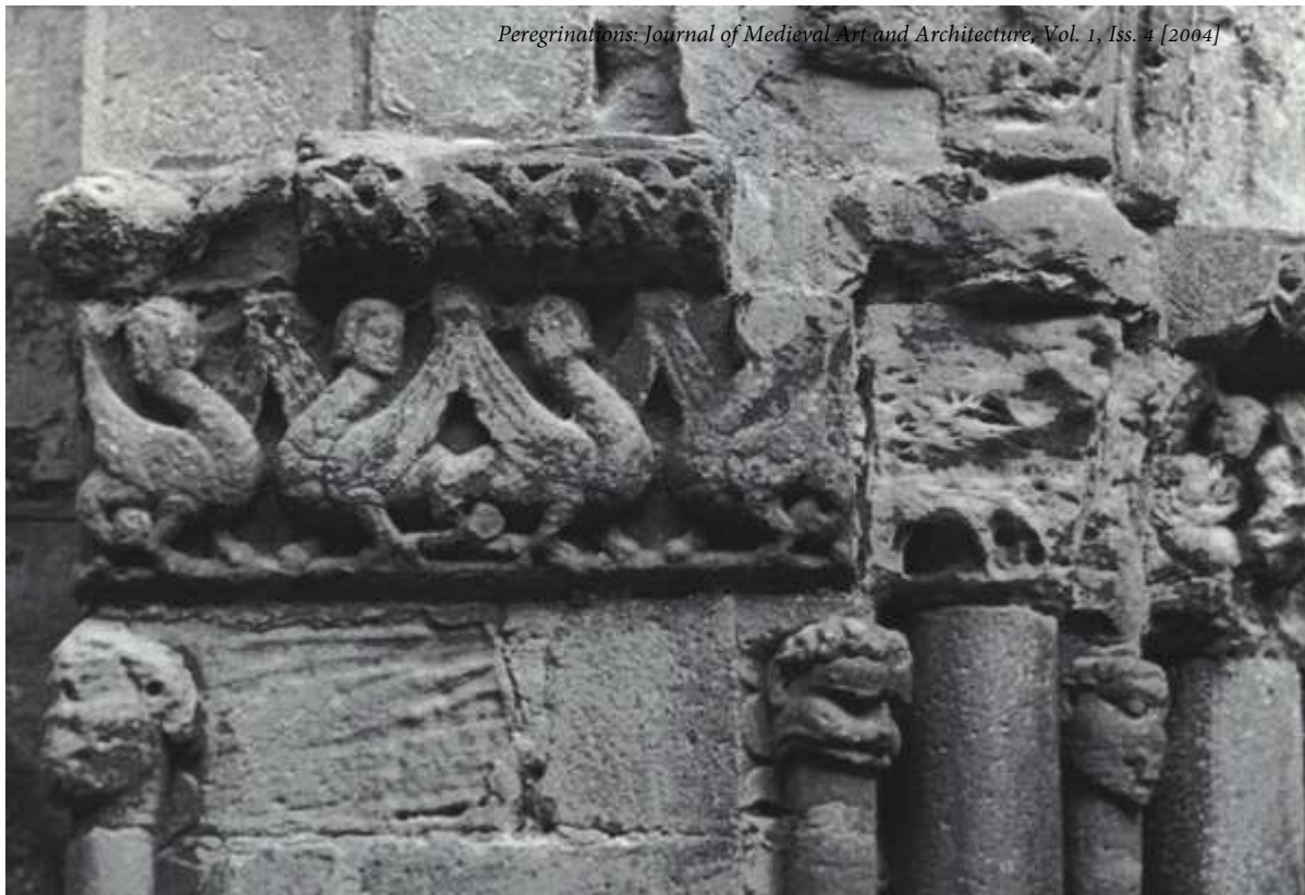
Detail of the left side of the west entrance, Church of Santiago, sculpture and column capitals Puente la Reina, Spain