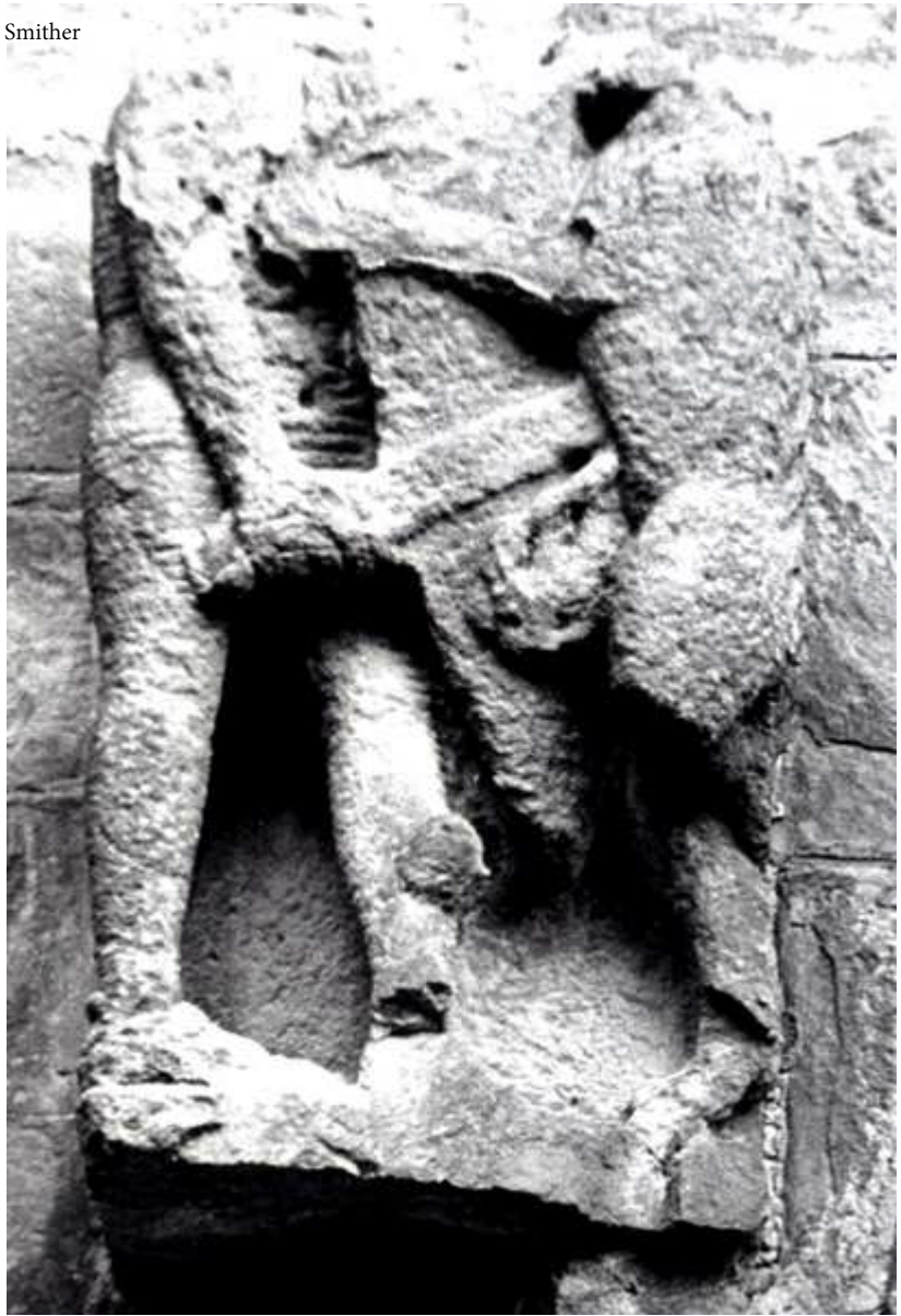
Detail of the left side of the west entrance, Church of Santiago, illustrating combat Puente la Reina, Spain