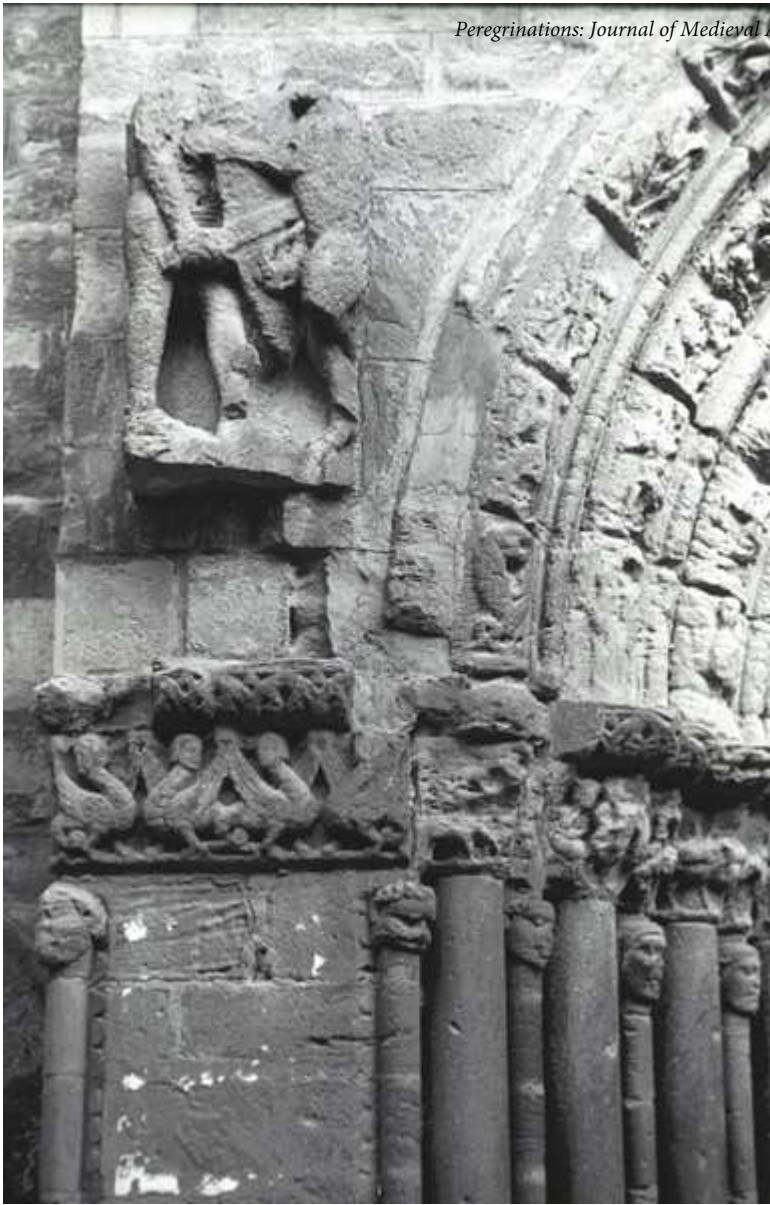
Detail of the left side of the west entrance, Church of Santiago Puente la Reina, Spain