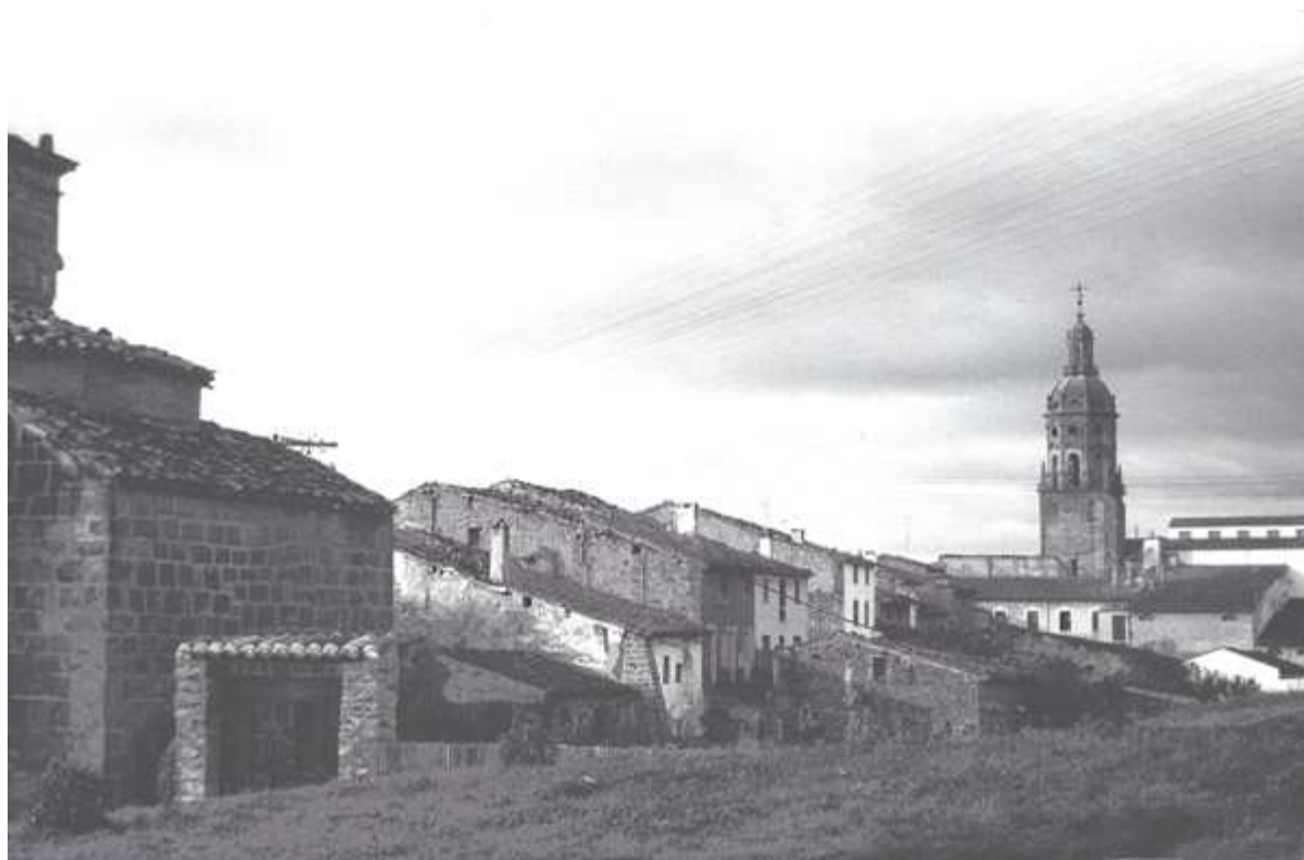
The town of Puente la Reina Puente la Reina, Spain