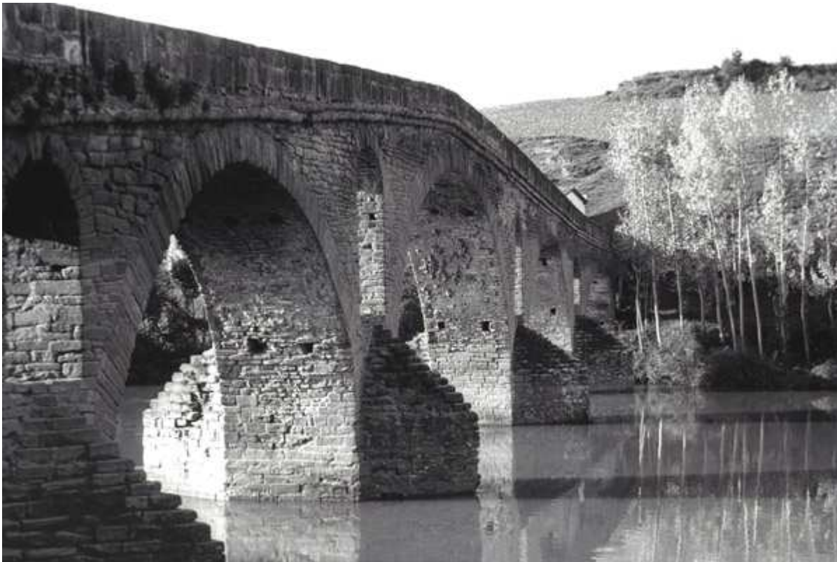
Puente la Reina Bridge Puente la Reina, Spain