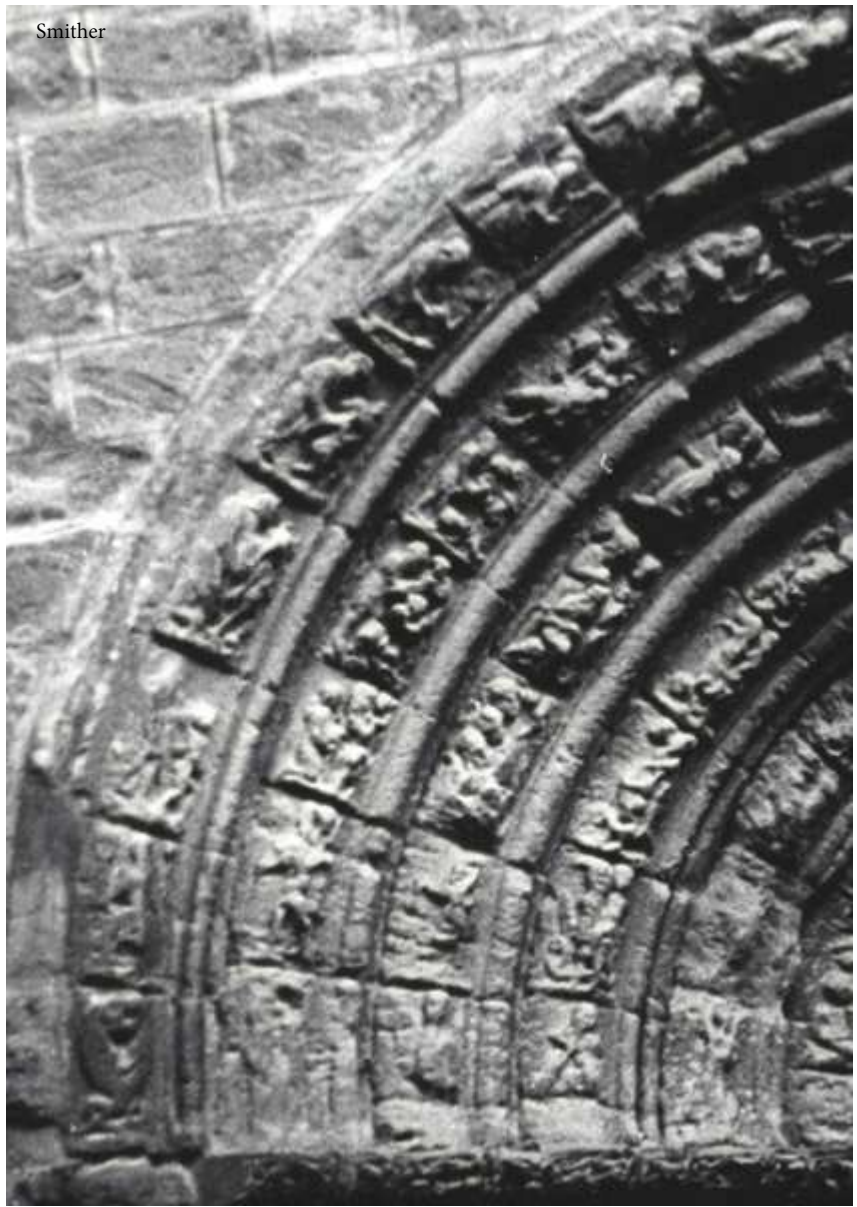
Detail of the sculpture from the Archivolt entrance, west façade of the Church of Santiago Puente la Reina, Spain