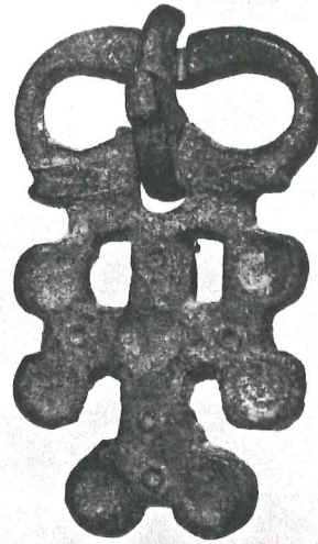
Bronze buckles very similar to the first and second in the previous illustration are in the Princeton collection: Left: late 6th-7th century; Right: 5 th century (?)