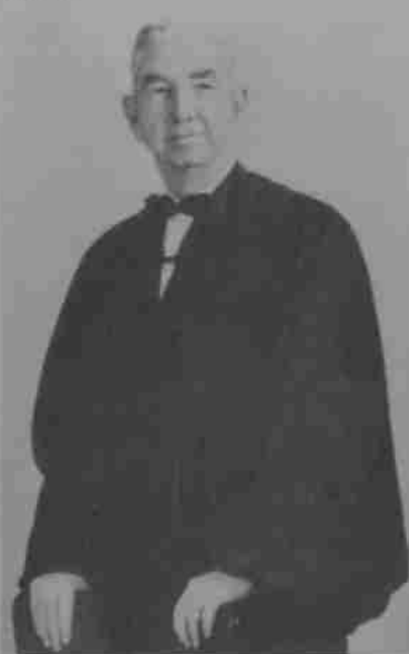
FORMER Supreme Court Justice Tom C. Clark.