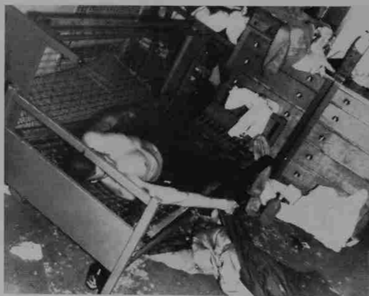
1962-1963 Dance Weekends — "They make their own beds at Harvard and Yale" — famous last words.

The president clicked off his dictaphone, leaned forward in his