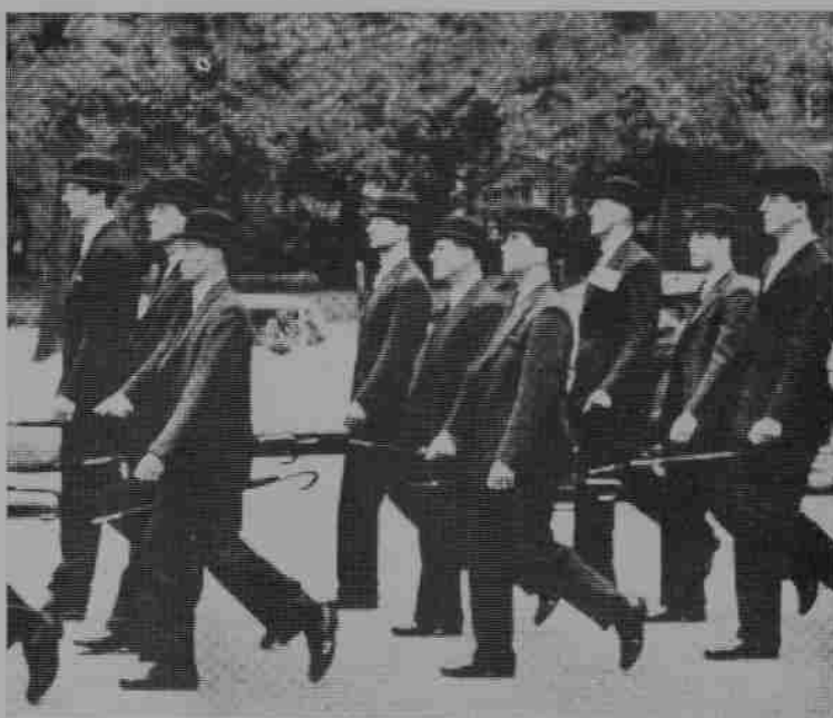
BIG LEAGUERS ALL. The class of 1966, obviously the best in the history of the College, shown drilling for the customary pajama parade.