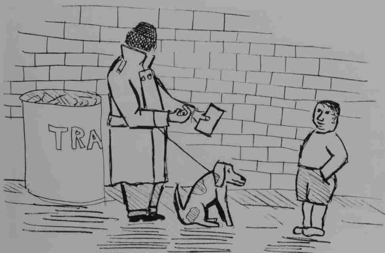
Pst! Sonny, wanna buy a cool undergraduate literary magazine?