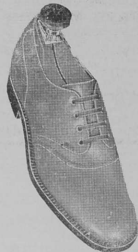
THE COLLEGE SHOP