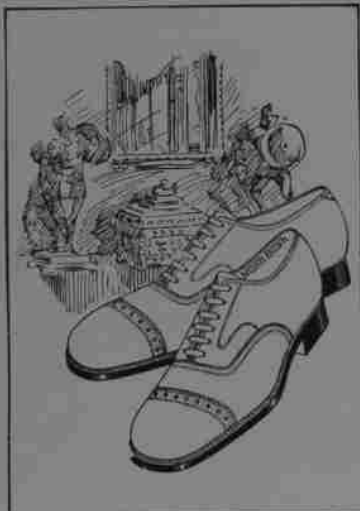
The Clyde Nunn-Bush Ankle-Fashioned