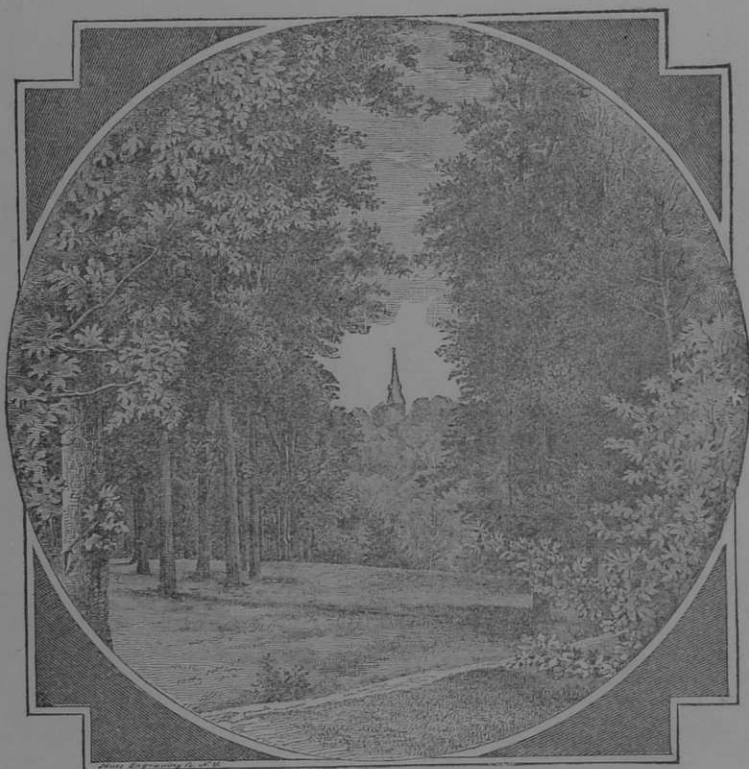
VIEW LOOKING TOWARDS THE COLLEGE CHAPEL.