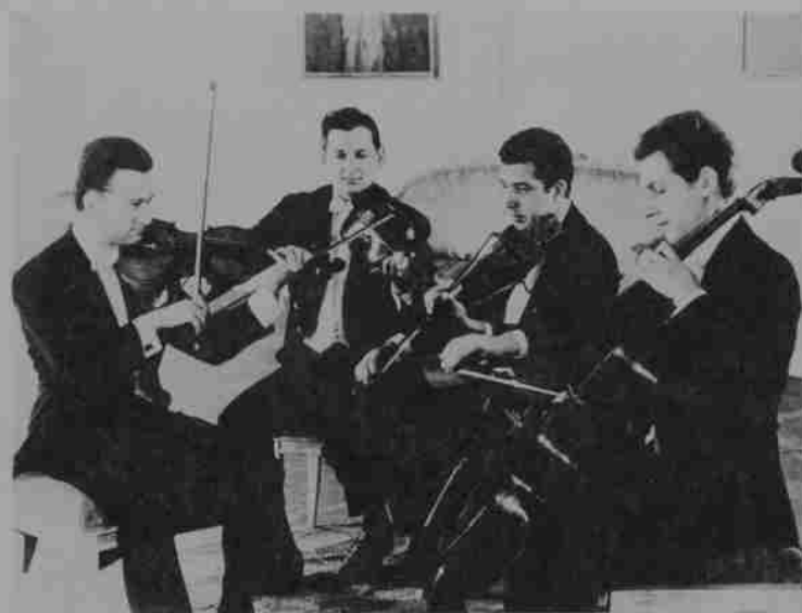
The Dimov Quartet