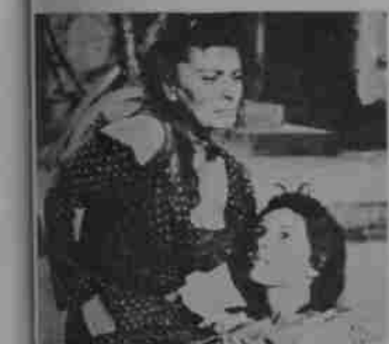
Sophia Loren (left) starring in Two Women .

This film, directed by the master of neo-realism, stars Sophia Loren in probably her finest screen performance. She won the Cannes Film Festival award and an Oscar for Best Actress (the only time an Academy Award has been given for a foreign language performance). The film is the story of a mother and a daughter struggling to survive in Italy during World War II. Jean-Paul Belmondo and Eleanora Brown also deliver fine performances. De Sica, with films such as this and THE GARDEN OF THE FINZI-CONTINIS brought the techniques of neorealism to greater maturity and revealed powerful new possibilities for dealing with social and political problems through the use of the film medium.