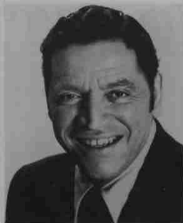
Fats Waller "Jr."