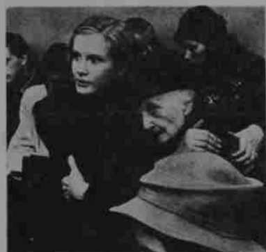
Dominique Sanda in "The Garden of The Finzi-Continis".