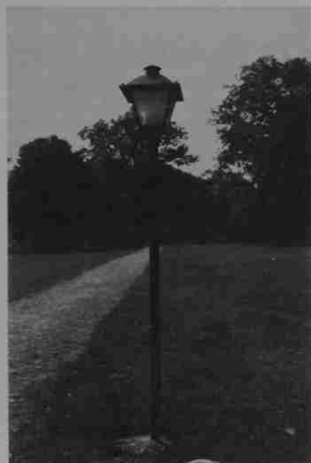
Our Silent Protector