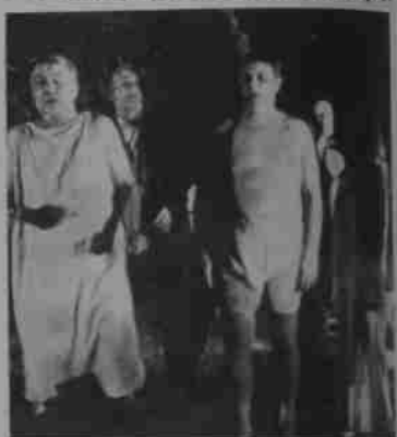
Zombies search for nourishment in Night of the Living Dead .

Without doubt, the 1968 production of producer George Romero's The Night of the Living Dead remains a remarkable achievement in the notoriously insipid genre of horror film. There is nothing subtle about this movie. The emphasis is on crude, oblique violence that includes a cannibalism scene which is truly one of the most revolting spectacles in the history of