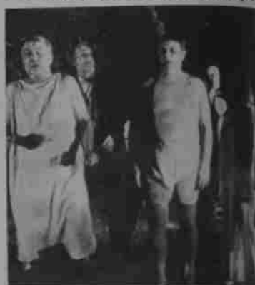
Zombies search for nourishment in Night of the Living Dead .

Without doubt, the 1968 production of producer George Romero's The Night of the Living Dead remains a remarkable achievement in the notoriously insipid genre of horror film. There is nothing subtle about this movie. The emphasis is on crude, oblique violence that includes a cannibalism scene which is truly one of the most revolting spectacles in the history of