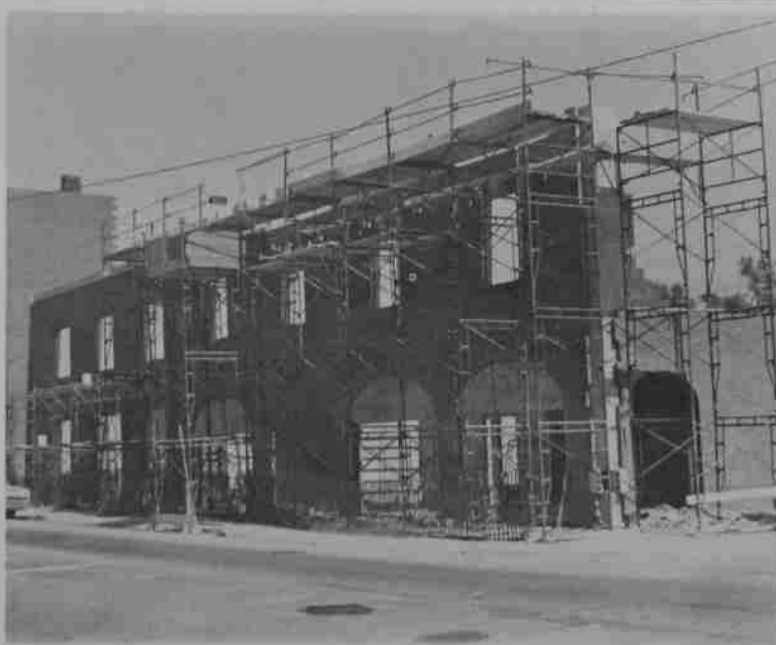
Mt. Vernon Theater in Construction