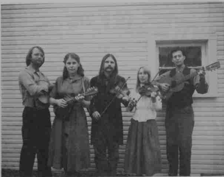
Area folk fiddlers, the Red Mules