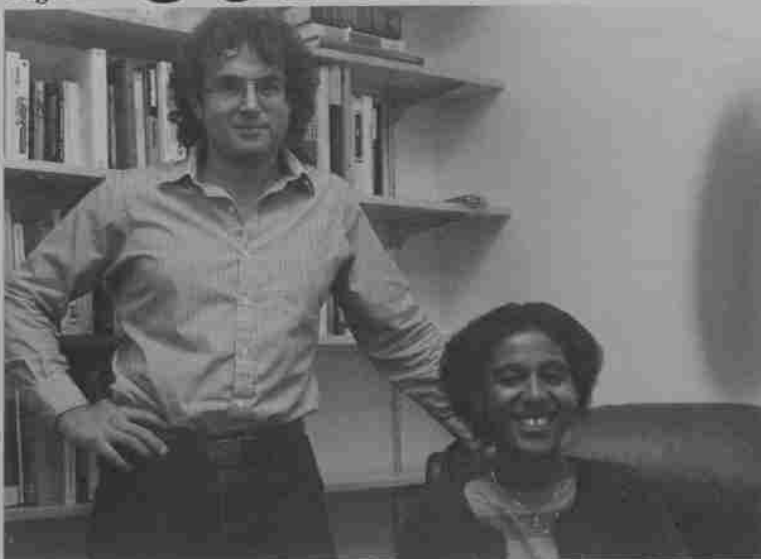
Health service additions Hampel and Hall