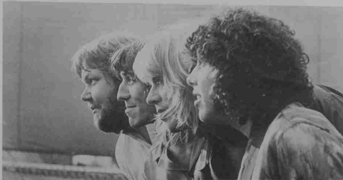
The New Rhythm and Blues Quartet will perform at tomorrow's IFC picnic.