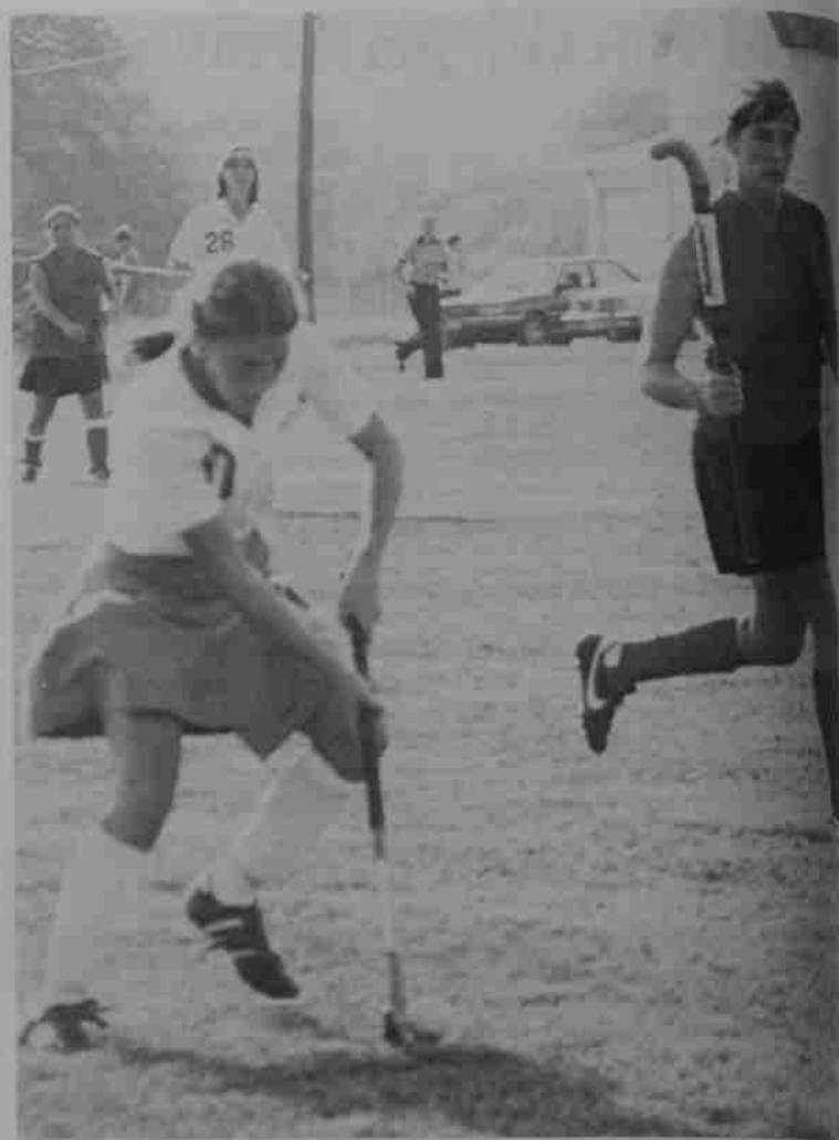
Ladies in action. See story - Page 5

The Lords should not be too disappointed with only a three point loss to the ninth ranked team in Division III. The Lords must try to eliminate turnovers and fine tune their execution if they are to get back on the winning track against Ohio Wesleyan University this weekend in Delaware Ohio.