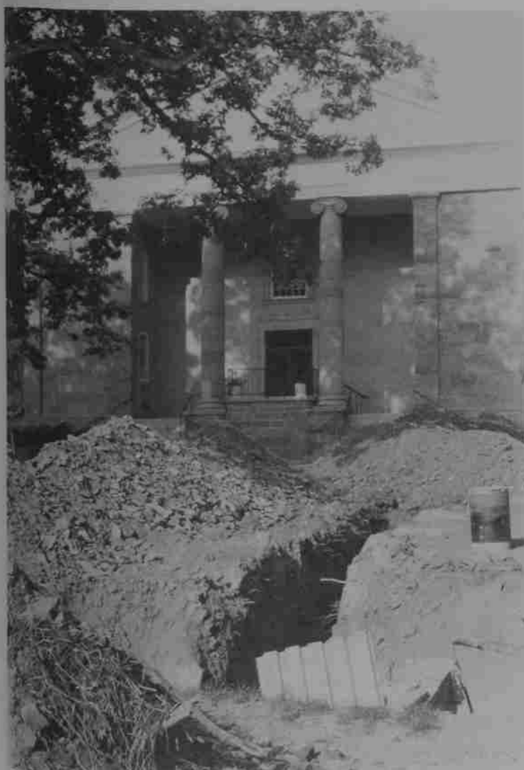
Rosse Hall stands amidst the work of two construction projects

Once the installations are completed, the Jazz Band will attempt to use the Peirce Music Room as a permanent rehearsal area. Because that ensemble is very large, with amplified sound, the department is not certain that even those new sound blocking and absorbing techniques will prevent too much noise from escaping. So Posnak says that the Jazz Band will try it out, and if the noise problem is too great, move on to a new site.