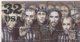
Allies liberate Holocaust survivors, early 1945