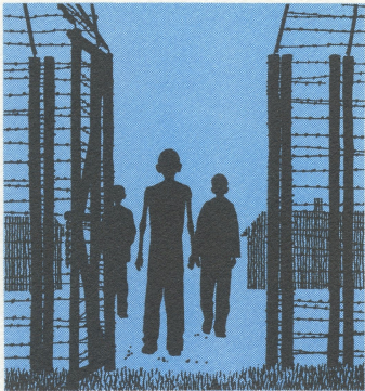
Allies liberate Holocaust survivors, early 1945