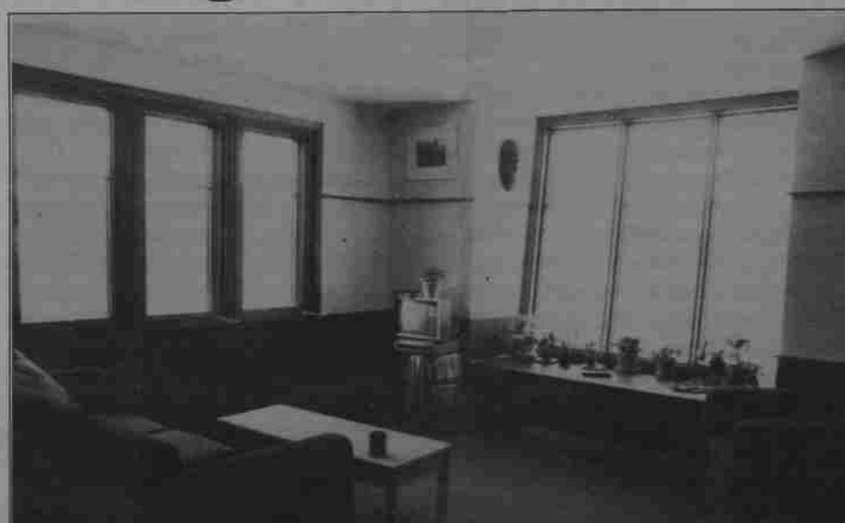
The completed version of the Woodland cottages.

The Woodland Cottages bear striking resemblance to a ski chalet, considering the enormous windows in common areas, wood paneling and vaulted ceilings on the top floors. "I don't know if I should go skiing, spy on the neighbors or lay naked on the plush carpeting," remarked Junior Dave Hollister.