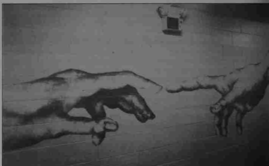
Mural brightens wall of third floor Mather.