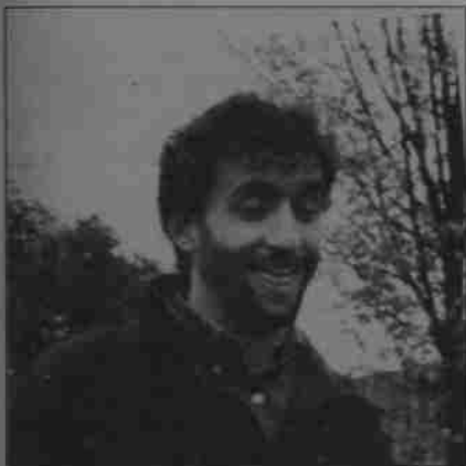
"A chicken." Evan Diamond '94