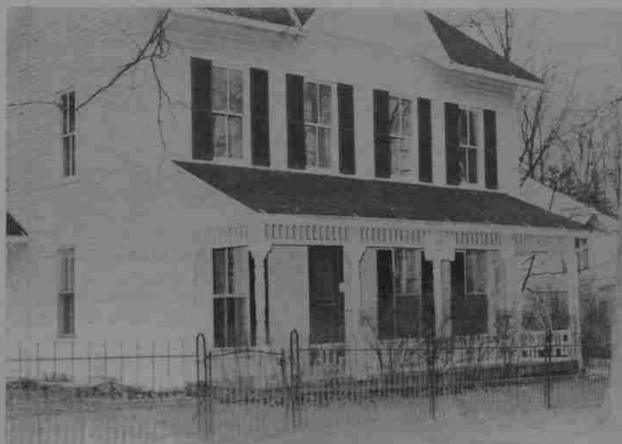
What was once known as the Smythe House is now a central location for Women's Activities