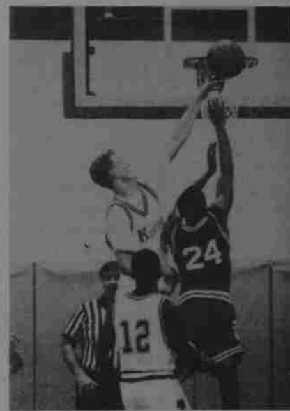
Lords in action against Denison.