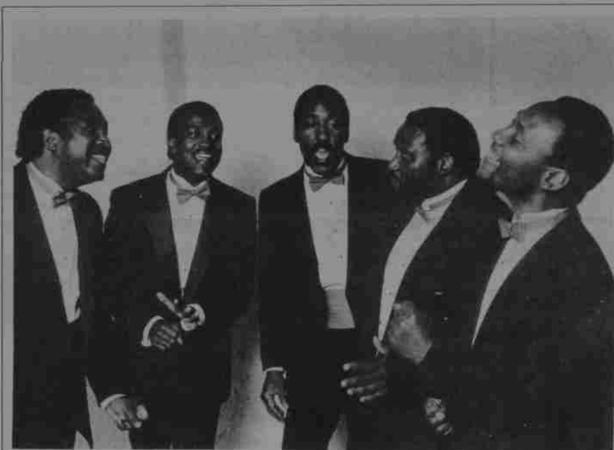
The Birmingham Sunlights

with the more stylized commercial elements of rock to churn out songs in a genre aptly named "folk-rock." The college craze of staging folk festivals eventually perished with lava lamps.