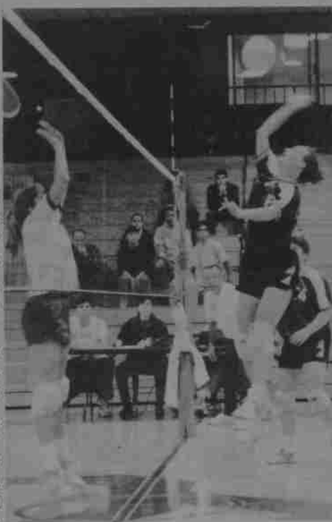
volleyball team in action