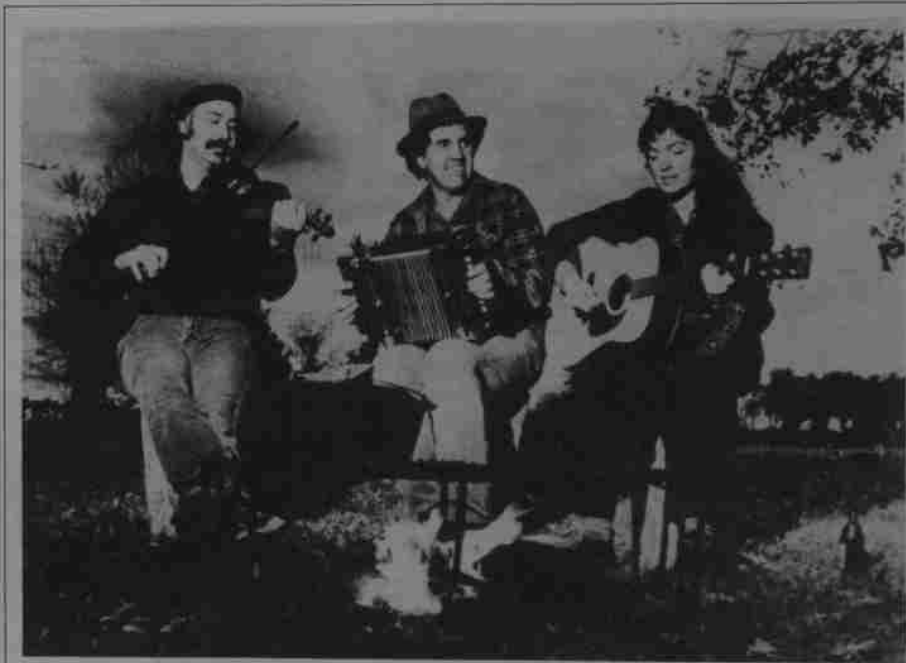
The Savoy-Doucet Cajun Band