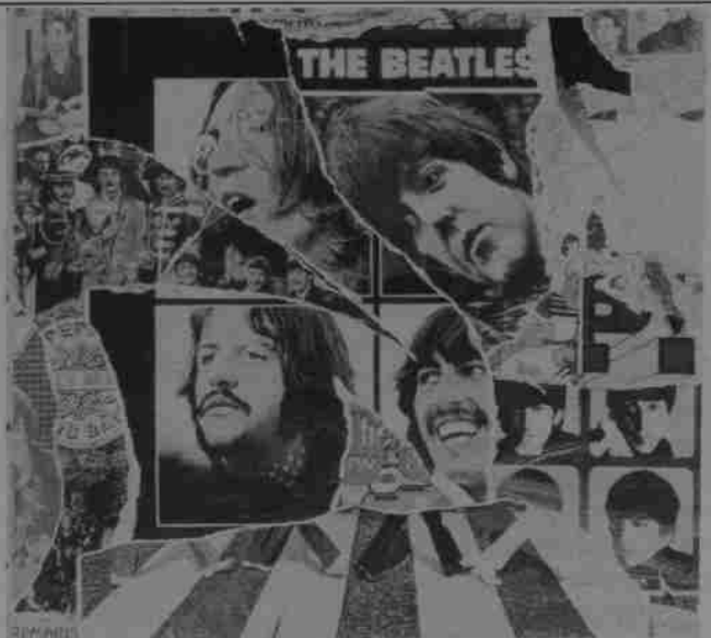
The cover of the Beatles' Anthology III