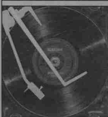
What, no White Stripes? Glassjaw, Atmosphere and the Deftones make it to the top 10.

Unquestionably my favorite album by one of my favorite bands, White Pony sounded amazing when it came out in the summer of 2000, and it still holds its own today. It showed the band growing by leaps and bounds, truly mastering their craft. Unfortunately, given the lackluster follow up Deftones , released last year, this record may wind up the pinnacle of the 'Tones career, rather than serve as a harbinger of greater things to come. Regardless, White Pony also earns a special place in my heart for being the first CD I ever reviewed for the