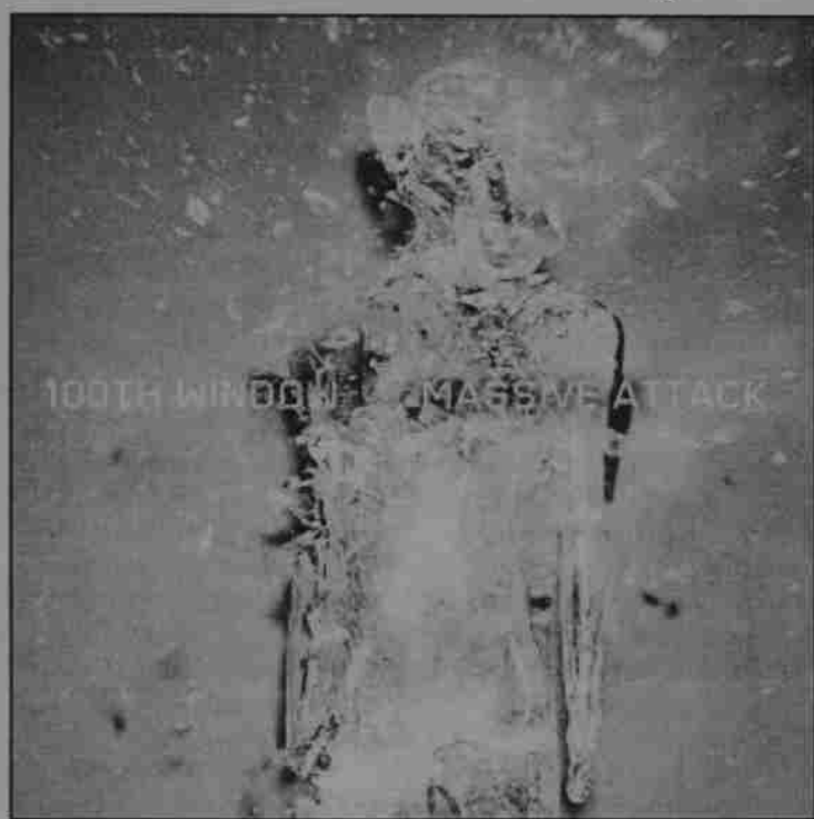
The cover of Massive Attack's shattering new record, 100th Window .

Massive Attack has always placed great emphasis on vocals and harmonies to ride atop their beats, and this album is no different. Sinéad O'Connor is featured on three tracks, and her best work is turned in on "Prayer for England." Having garnered a reputation as a social activist in England,