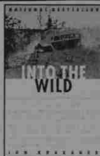
Jon Krakauer Into the Wild , 207 pp. Anchor Press