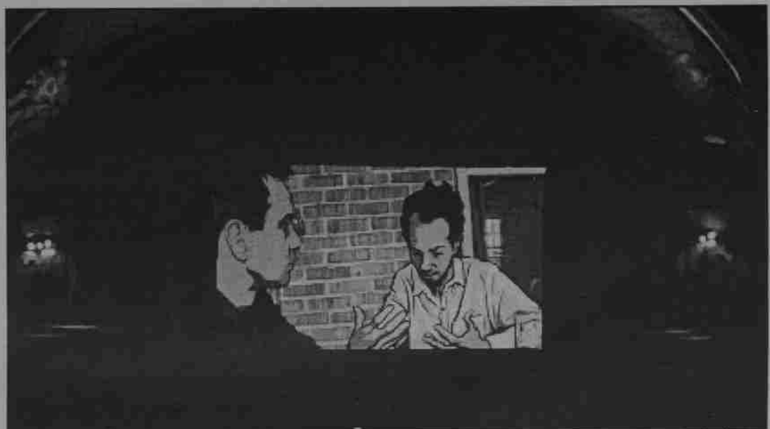
A striking still from Waking Life , where dreams mingle with reality.

Ultimately, No Man's Land works so well because Tanovic captures the absurdity of the situation without compromising its humanity. The intelligent manner in which Tanovic handles difficult questions about the nature of hatred and of war makes No Man's Land particularly timely.