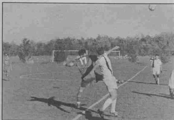
A Lord fights for the ball against Hiram.