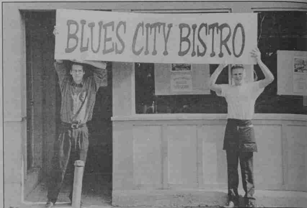
Blues City Bisto, located at 222 South Main Street in Mt. Vernon, opened for business yesterday.

The Bisto will be open Tuesdays through Thursdays from 11 a.m. to 9 p.m., Fridays and Saturdays from 11 a.m. to 11 p.m. and Sundays from 11 a.m. to 4 p.m. It is located at 222 South Main Street in Mt. Vernon.