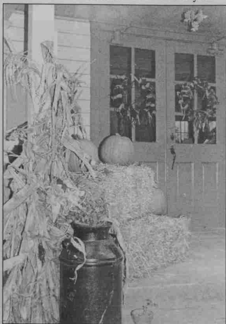
One of the many decorated doors in Gambier.