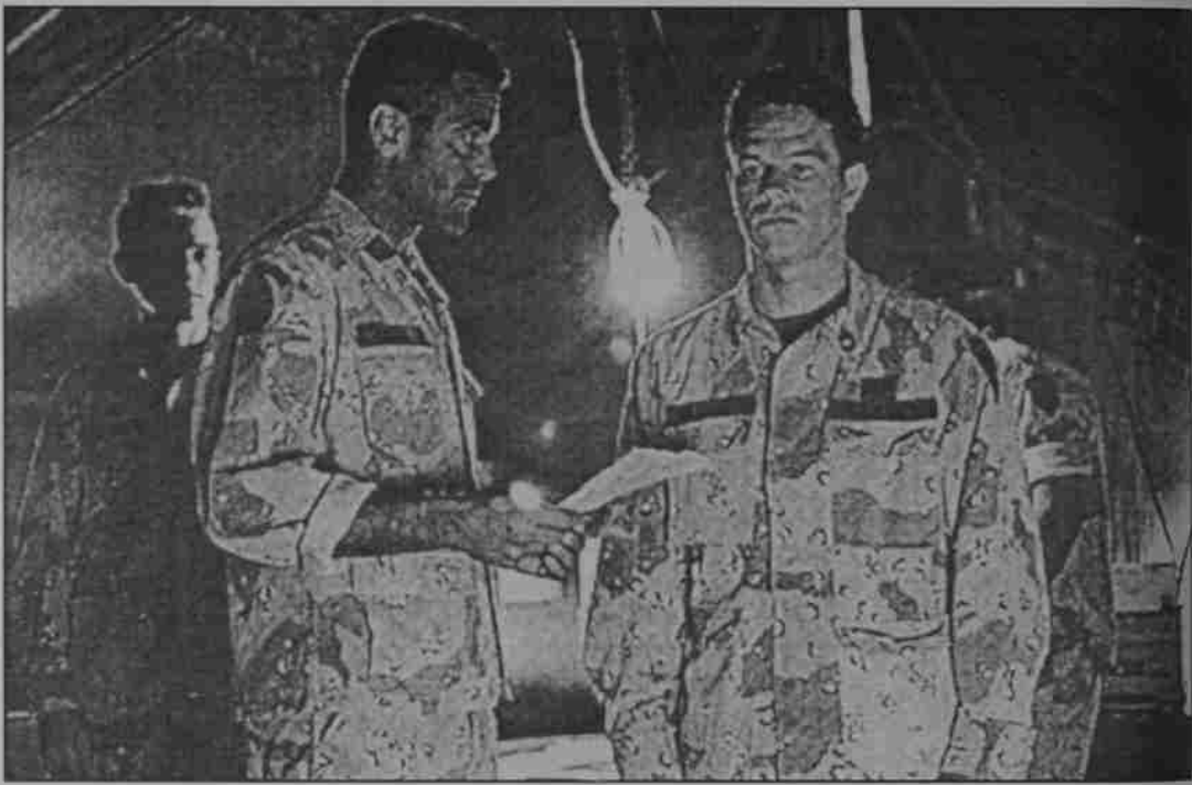
George Clooney and Mark Wahlberg in Three Kings .