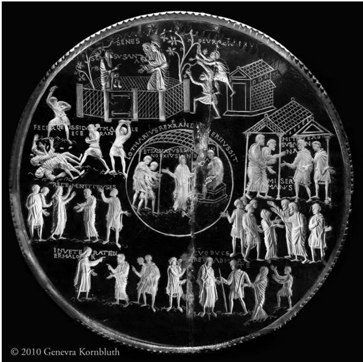
Susanna Crystal, c.855-69, Carolingian Period, BM 55.12-1.5.