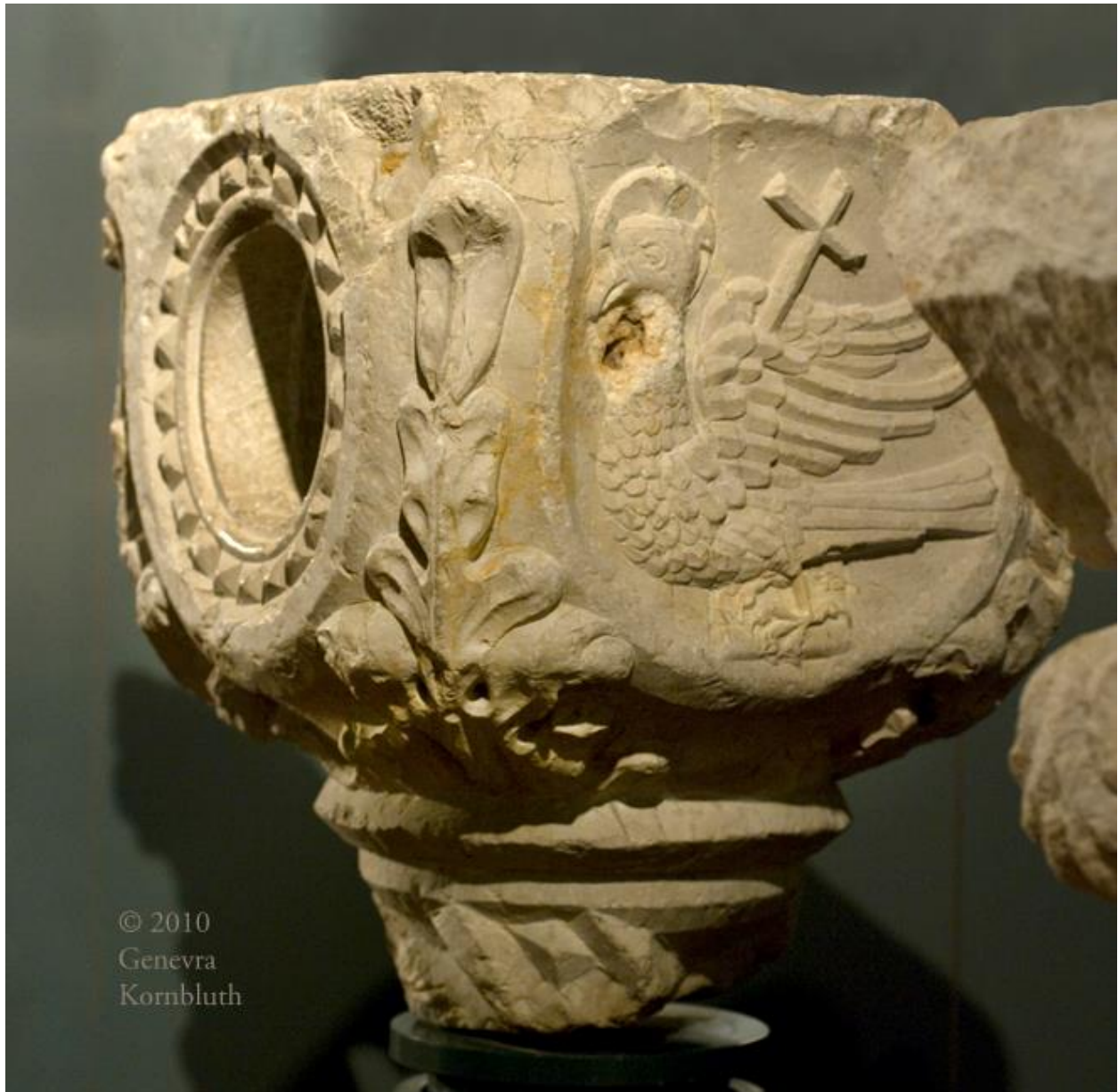
Leno Monastery, capital (reliquary?), late 14th to early 15th c., Brescia, Italy. Museum of Santa Giulia.