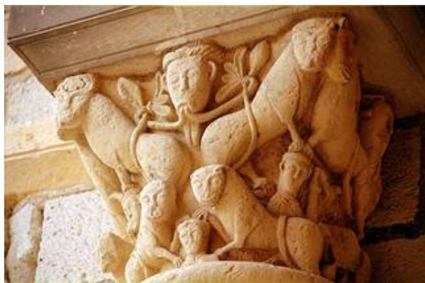
Capital from Saint Benoît sur Loire

One of the most beautiful sites on the internet! Filled with gorgeous pictures of Romanesque and Gothic churches, sculpture, and painting; the site also has special categories focusing on Cistercian art and Romanesque sculpture. Hundreds of small, out-of-the-way churches plus immense, magnificent cathedrals are featured.