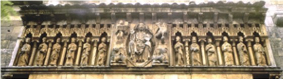
Previous image cropped to Christ and the apostles only. Moarves de Ojeda, Province of Palencia, Spain. (1973)