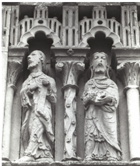
Two of the apostles. Moarves de Ojeda, Province of Palencia, Spain. (1973)