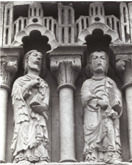
Two of the apostles. Moarves de Ojeda, Province of Palencia, Spain. (1973)