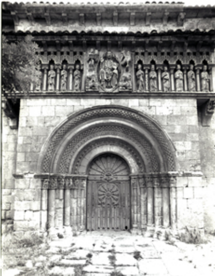
General front view of the facade at Moarves de Ojeda. Province of Palencia, Spain. (1973)