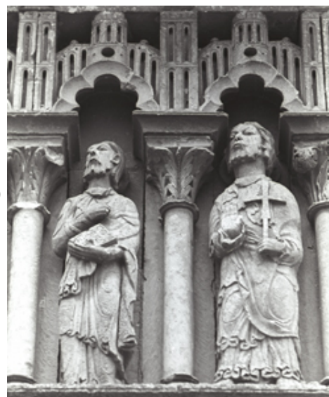
Two of the apostles. Moarves de Ojeda, Province of Palencia, Spain. (1973)