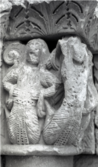
Left group; 4th from the left. Two dancers. Moarves de Ojeda, Province of Palencia, Spain. (1973)