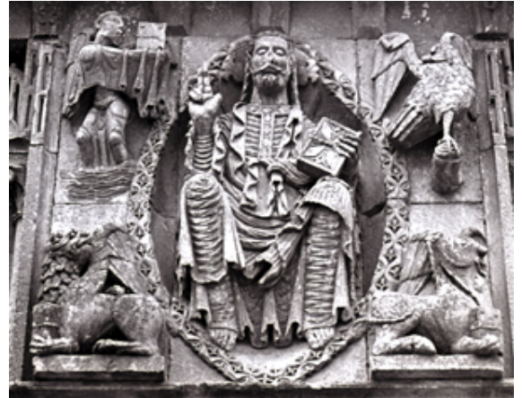
Christ and symbols of the evangelists. Moarves de Ojeda, Province of Palencia, Spain. (1973)