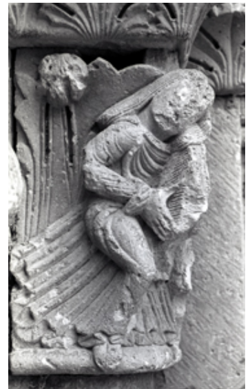
Left group; 5th from the left. Musician with harp. Moarves de Ojeda, Province of Palencia, Spain. (1973)