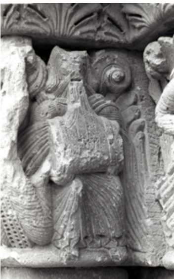
Left group; musician with instrument unknown to me. Located around a corner between the capitals I have identified as 4th and 5th from the left. Moarves de Ojeda, Province of Palencia, Spain. (1973)