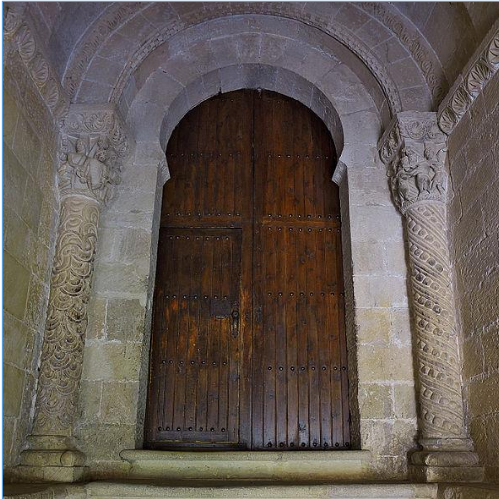
Figure 1 Puerta de las Vírgenes. Monasterio de Santo Domingo de Silos.

multivalency of meaning is del Álamo's convincing argument that because the patron saint and early abbot, Santo Domingo, was originally buried in the north gallery—today marked with a raised cenotaph-- the cloister was most likely open to lay pilgrims. It is therefore with the addition of this audience that she employs the corner pier reliefs as her iconographic guideposts, illustrating that although there appears to have been no “prescribed lines of perambulation,” the pier reliefs are “thematically related to accommodate a cloister that was passed through in a variety of directions,” by a greater variety of people than generally believed.