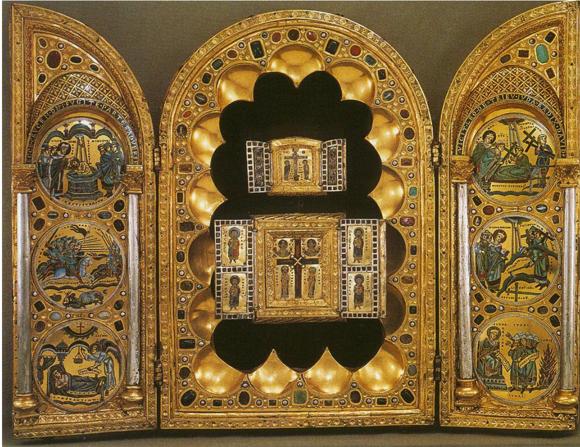
Stavelot Triptych, Mosan, Belgium, c. 1156–58. 48×66 cm with wings open, The Morgan Library & Museum, New York City.

most part, a convincing one. Hahn recognizes the enormous variety of reliquaries and impossibility of writing about all of them. This book therefore focuses on key types — namely portable reliquaries that conform to a biblical precedent (the ark and the cross, for example) and body-part reliquaries. Throughout her book, Hahn provides keen insights into the material, production and display of relics and their containers (as well as the related issue of their visibility). Most significantly, she shows how the manipulation of this material over time affected the meaning of these objects for their viewers. Hahn argues for the shifting meaning and functions of reliquaries after 1204 with the Sack of Constantinople and subsequent influx of relics into western Europe, and thus chooses this