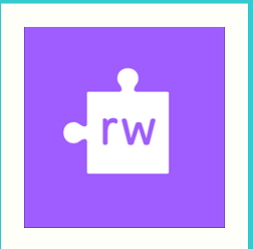
<u>Click here for more information</u> <u>on how to download and use</u> <u>Read & Write.</u>