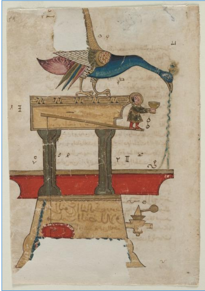
Figure 2 Peacock-shaped Hand Washing Device: Illustration from The Book of Knowledge of Ingenious Mechanical Devices (Automata) of Ibn al-Razzāz al-Jazarī, 1315. Syria, Damascus, Mamluk Period, 14th Century. Opaque watercolor and gold on paper; overall: 31.3 x 21.5 cm (12 5/16 x 8 7/16 in.). The Cleveland Museum of Art, Purchase from the J. H. Wade Fund 1945.383.a.

Fliegel traces the history of automata back to antiquity, citing technical treatises and literary descriptions, and discusses the later enthusiasm for automata in the Byzantine and Artuqid courts. 2 He examines The Book of Knowledge of Ingenious Mechanical Devices , a remarkable treatise on the construction of automata, written and illustrated by the Artuqid craftsman Ibn al-Razzāz al-Jazarī in 1206; its detailed technical descriptions and splendid illustrations provide scholars with an unparalleled glimpse into the creation and use of automata in the Islamic world, an apposite counterpoint featured in both his essay and Cleveland’s exhibition ( Fig. 2 ). In the western medieval context, Fliegel mentions a drawing of a bird drinking