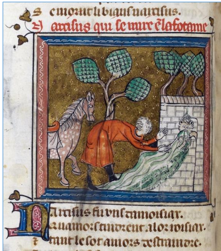
Figure 4 French, Royal MS. 19 B XIII, Roman de la Rose , folio 14 v, detail of Narcissus at the Fountain, c. 1320-40. The British Library, London.

The Cleveland Table Fountain's engagement of one's visual, olfactory, auditory, and even haptic sensorial faculties, prompts Gertsman to understand fountains as necessarily sensual objects. In her essay, "Sensual Delights: Fountains, Fiction, and Feeling," she leaves behind the physical fountains of the Valois courts, taking a more conceptual approach and turning her attention to fountains of the medieval imagination. Surveying a considerable selection of medieval visual representations