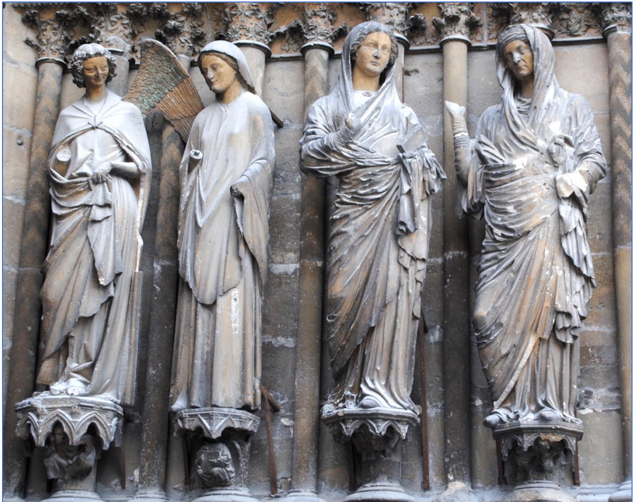
Figure 1 The Annunciation and Visitation. Jamb sculptures at the central portal of the west façade, Notre-Dame Cathedral of Reims.

Mary's thighs, and evidence for the original colors of the sculpture at Reims goes unremarked.