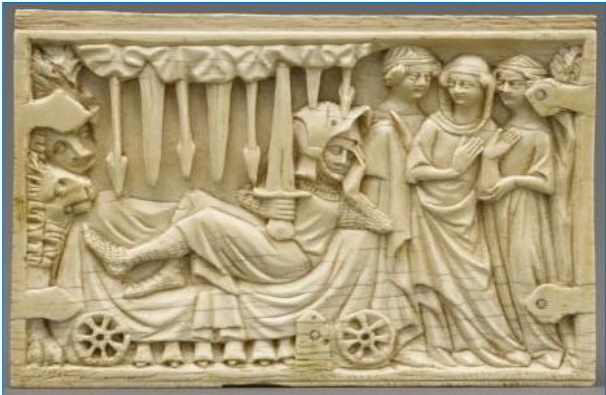
Figure 1 Gawain on the Bed of Marvels, panel from a casket, France, c. 1300-20. Elephant ivory.

repurposing of treasury objects on two reliquaries commissioned by Egbert, Archbishop of Trier.