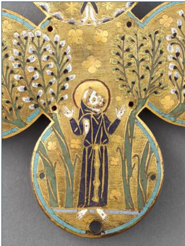
Figure 2 Saint Francis Receiving the Stigmata, detail of a reliquary, France, c. 1250-70. Champlévé enamel.

A Reservoir of Ideas is ideal for the scholar with some background in medieval sculpture who is curious to learn more about the various directions taken by current scholarly studies of the subject. The specificity of each article, paired with the broad scope of topics covered in the volume overall, ranging from an ivory statuette of Saint Francis (“Saint for All Seasons: A Gothic Ivory Statuette of Francis of Assisi” by Charles T. Little) (fig. 2), to English choir stall carvings (“The Blythburg Choirstall Carvings” by Richard Marks) provide both a general overview of recent medieval sculpture studies, as well as more in-