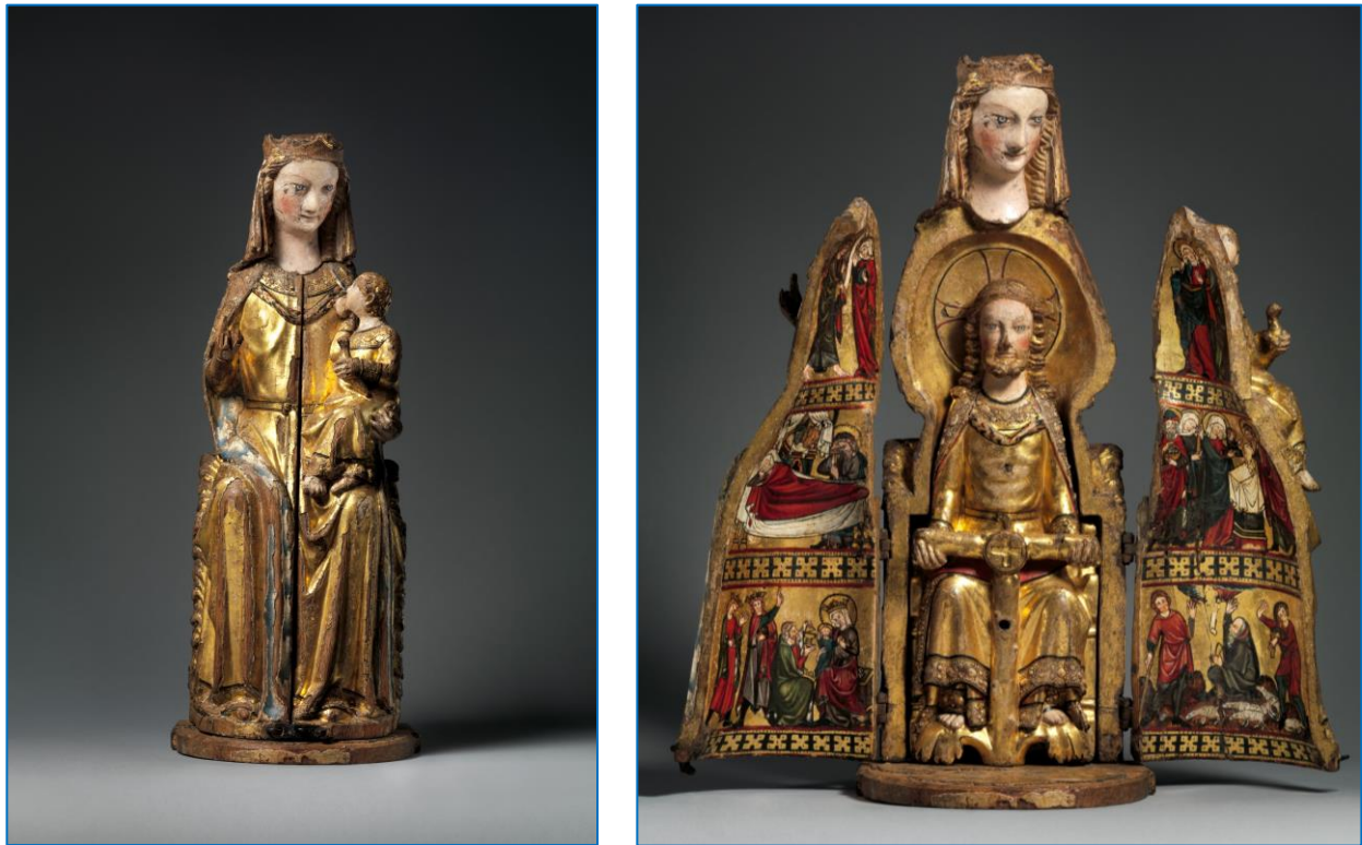
Figure 1 Shrine of the Virgin (ca. 1300).

Madonna meets these challenges head on, seeking to understand the place such objects held in the hearts and minds of medieval Christians.