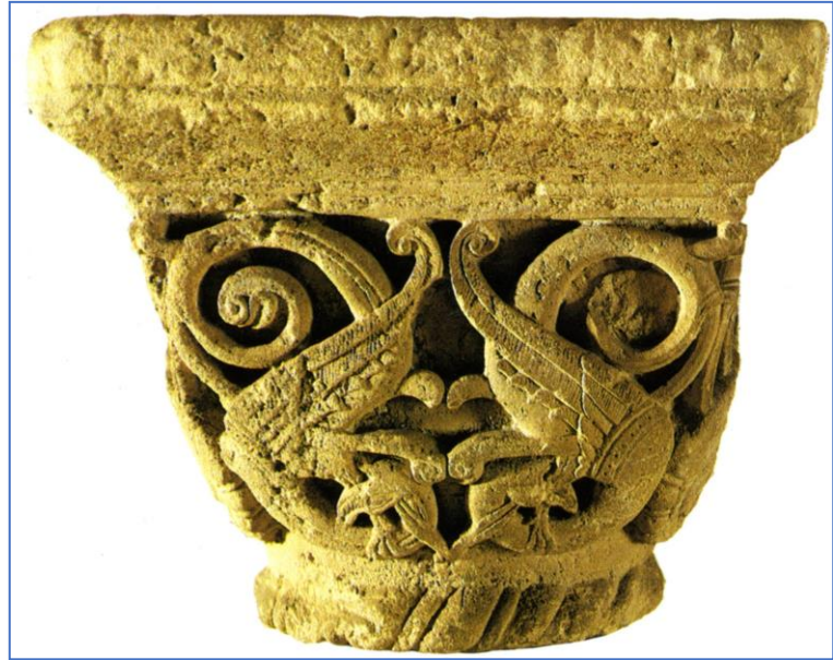
Figure 3 Capital from Reading Cloister.

a showpiece in an era of virtuosic cloisters, and given its links with Lewes, and on to Cluny, it is likely to have been well known. In the Anglo-Norman world, it gave birth to a particular type of cloister -- a line of descent that includes Hyde and Westminster Abbeys. It also seems to have been fundamental in giving a new voice to a long-standing Anglo-Norman interest in alternation and aesthetic variety, by showing how rhythmic variation works profitably on a small scale. A monograph on such a building is to be warmly welcomed. 🐼