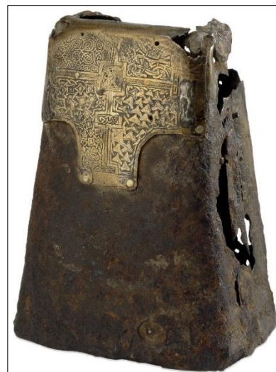
Bearnán Conaill (St. Conall's Bell), 8th-9th century bell with 10th century bronze plate.

On the whole this is a marvelous book and adds much to earlier studies of Irish relics. The book has shown relics and reliquaries are more than just beautiful artifacts created to honor the saint; they could create holy space through procession and movement. They tell the story not just of the saint and religious devotion, but also of the social and political landscape of the time they were created and refurbished. The author also shows the importance of a multidisciplinary approach which combines art history, historical sources, and hagiography to obtain the fullest picture of the role and function of these artifacts through time. The volume provides a clear and