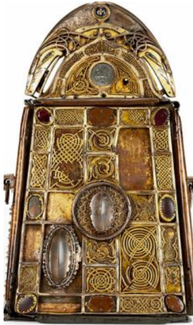
Shrine of St. Patrick's Bell, 1094-1105, Armagh.

Chapter five, Bells Relic and the Monastic Voice , examines the role and function of medieval bell relics and reliquaries. The author provides an interesting discussion of the