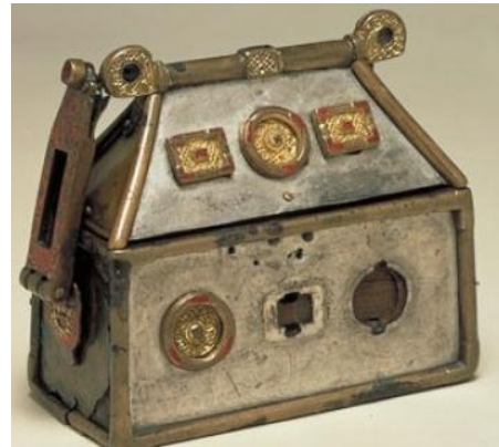
Monymusk Reliquary, 8th century.

symbolism of the imagery on Irish bells and their reliquaries and explores the bells role as props in ritual such as liturgical procession and the promulgation of laws. Overbey charts the use and function of bells within the monastic world and the transition of some as functional objects to the relics of saints. The chapter also explore the role of the saint's bell in hagiography. For