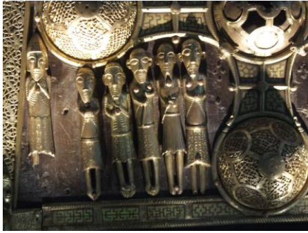
Figures on St Manchán's Shrine

The chapter provides an excellent discussion of the political mood of the time and charts the move from private collections of relics and antiquities into a national collection, with the creation of the National Museum of Ireland, undergoing a “geographical transformation or spatial rupture” becoming items of national importance. While reading this chapter, I visited the annual pilgrimage at Ballyvourney, Co. Cork, Ireland, in honor of the Irish St. Gobnait. Part of the modern pilgrimage includes the veneration of a small, wooden, 13 th -century statue of the saint which is kept locally within the parish. Each year local people continue to observe a centuries