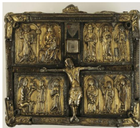
Domnach Airgid (Silver Church) shrine, 14th century.

She also briefly discusses how religious metalwork, such as reliquaries and processional crosses, could be "decommissioned" from their original monastic function and "appropriated to a new use," as objects of personal devotion, with many uses at sites which formerly were not associated with any relics. For instance, what appears to have been a broken metal cross and fragments of a bell were venerated at Lough Derg by lay pilgrims in the 17th century, yet there are no references to relics playing a role in the pilgrim rituals by earlier medieval pilgrims to the site. Similarly Murrisk Abbey, at the base of Croagh Patrick, recorded in 1652 as possessing a number of relics of St Patrick (including his teeth and the Black Bell of St. Patrick), which were used in the pilgrim rituals of post medieval pilgrims, at the Summit of the holy mountain until the 1800's. As at Lough Derg historical sources suggest that relics didn't play a part in medieval pilgrimage at the site. Unfortunately the author doesn't have space to explore how