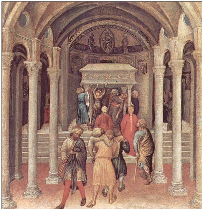
Figure 1 Gentile da Fabriano, Pilgrims at the Tomb of St. Nicholas , predella of the Quaratesi Polyptych, collection of National Gallery of Art, Washington, D.C., 1425.

published here present a more focused constellation of study divided into two sections, the first covering the wider Mediterranean basin and the second exploring pilgrimage in Italy. This framework, in combination with Davies and Howard's introduction and the afterword by Herbert Kessler, helpfully situates the phenomenon of later medieval pilgrimage in a wide-ranging cultural context. The broad geographical coverage of the included essays reflects the diverse nature of pilgrimage, a recurring theme in the collection, and the volume's structural separation between Italy and the rest of the Mediterranean is appropriately porous as essays in both parts refer to and draw upon issues raised in the other.