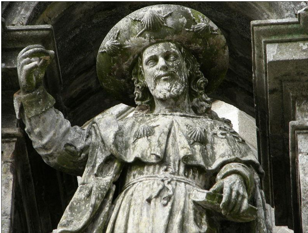
Figure 3 St. James the Greater, Puerta del Perdon, Santiago de Compostela.

Wendy Pullan explores the ubiquitous motif of the shell as a habitual part of pilgrimage, seeking to explain its development as a symbol specifically tied to Compostela and as representative of pilgrimage's broader ability to bring prominence to the mundane. In recognizing the shell's simultaneous roles as an individual bearer of meaning and repetitive, decorative emblem, Pullan's essay encourages us, like pilgrims, to critically examine aspects of the visual environment that we often take for granted.