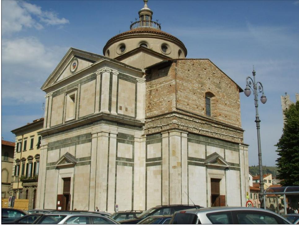
Figure 5 Giuliano da Sangallo, S. Maria delle Carceri, Prato, 1485-91.

Robert Maniura also sees central Italian pilgrimage as a web of sacred sites rather than an exclusive system based on competition. He connects the fifteenth-century church of S. Maria delle Carceri in Prato, a central-plan structure built around a miraculous Marian image, to the lesser-known S. Maria della Pietà at Bibbona via architectural design and complementary (not conflicting) function. Asserting that churches housing miraculous images of the Virgin in Italy were part of a widespread and inclusive pilgrimage structure, Maniura traces this architectural chain back to the Pantheon in Rome, which he suggests was a source of the tradition of placing a miraculous Marian image under a dome.