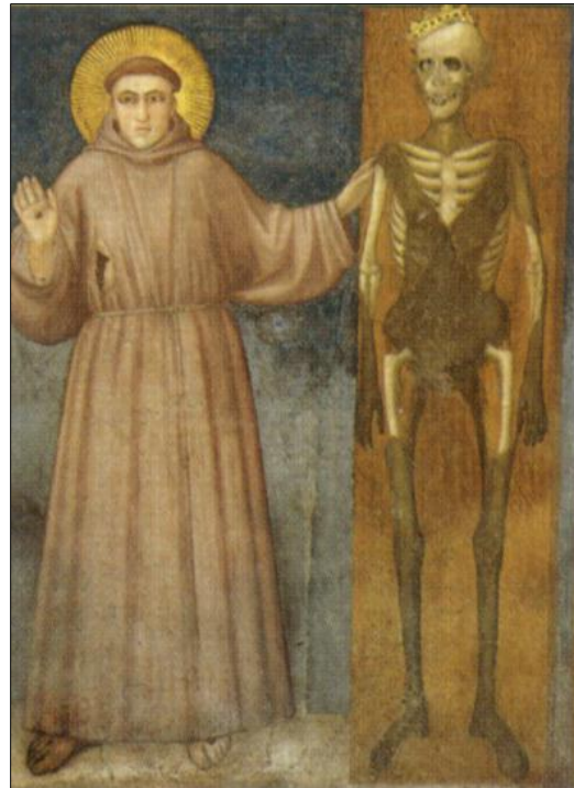
Figure 4 Giotto and workshop, St. Francis and Death, north transept, Lower Church of San Francesco, Assisi, c. 1308-11.