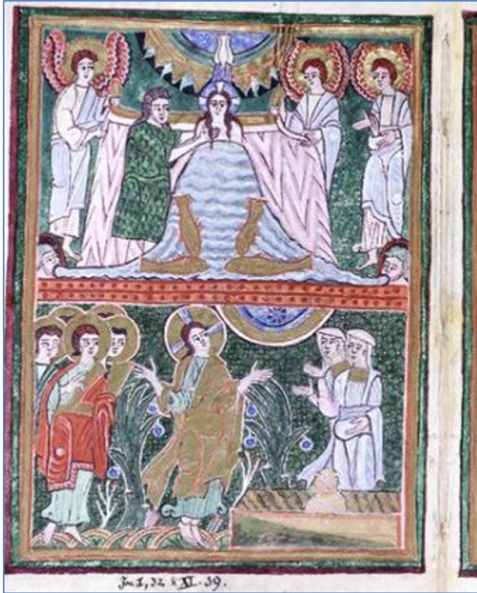
Figure 2 Hildesheim, Dom und Diözesanmuseum, Domschatz 18 (Bernward Gospels), fol.174v, Baptism of Christ (above) and Raising of Lazarus (below).

served as exempla for Bernward, and thus in many ways their images in this book also referred to the roles that Bernward himself served: he was both a priest and also a messenger of the gospels. Thus, if the dedication scene visualizes the treasury's sacred