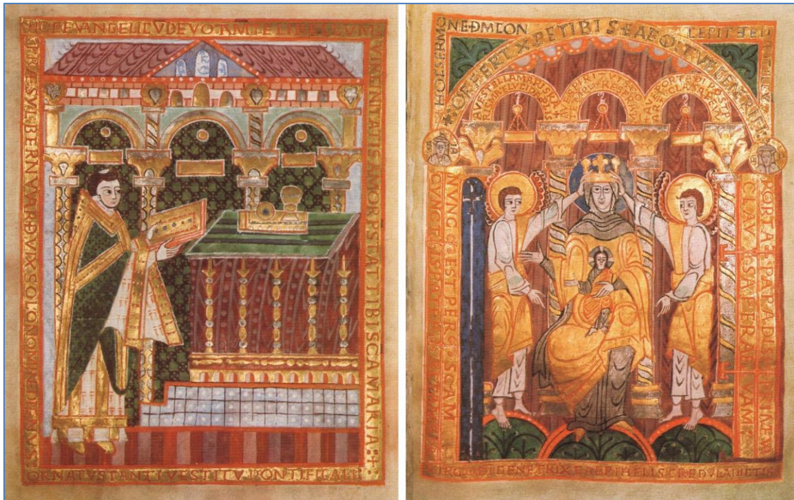
Figure 1 Bifolium, Bernward Gospels. Hildesheim, Dom- und Diözesanmuseum, Domschatz 18.