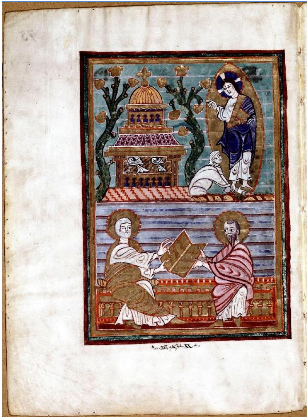
Figure 3 Hildesheim, Dom und Diözesanmuseum, Domschatz 18 (Bernward Gospels), fol. 75v, Noli me tangere (above) and Peter Charging Mark to Write the Gospels (below).