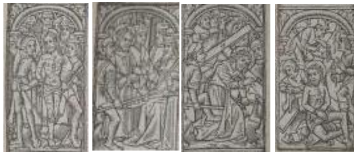
Figure 3 Casket, Burgundy/Flanders c. 1450-1500

While the connection to these printed images does not guarantee Parisian production, as these illustrations traveled and became models for artists across the globe, given the presence of large scale ivory workshops in the city c. 1500 we at least need to consider the French capital in our discussion of provenance for objects like no. 20. These kinds of associations based on localized models, of course, need to be taken with sizable grains of salt. The Creation of Eve and the Annunciation panel (no. 21) deftly provides that cautionary specimen. Stylistically linked to France of the Late Flamboyant period,