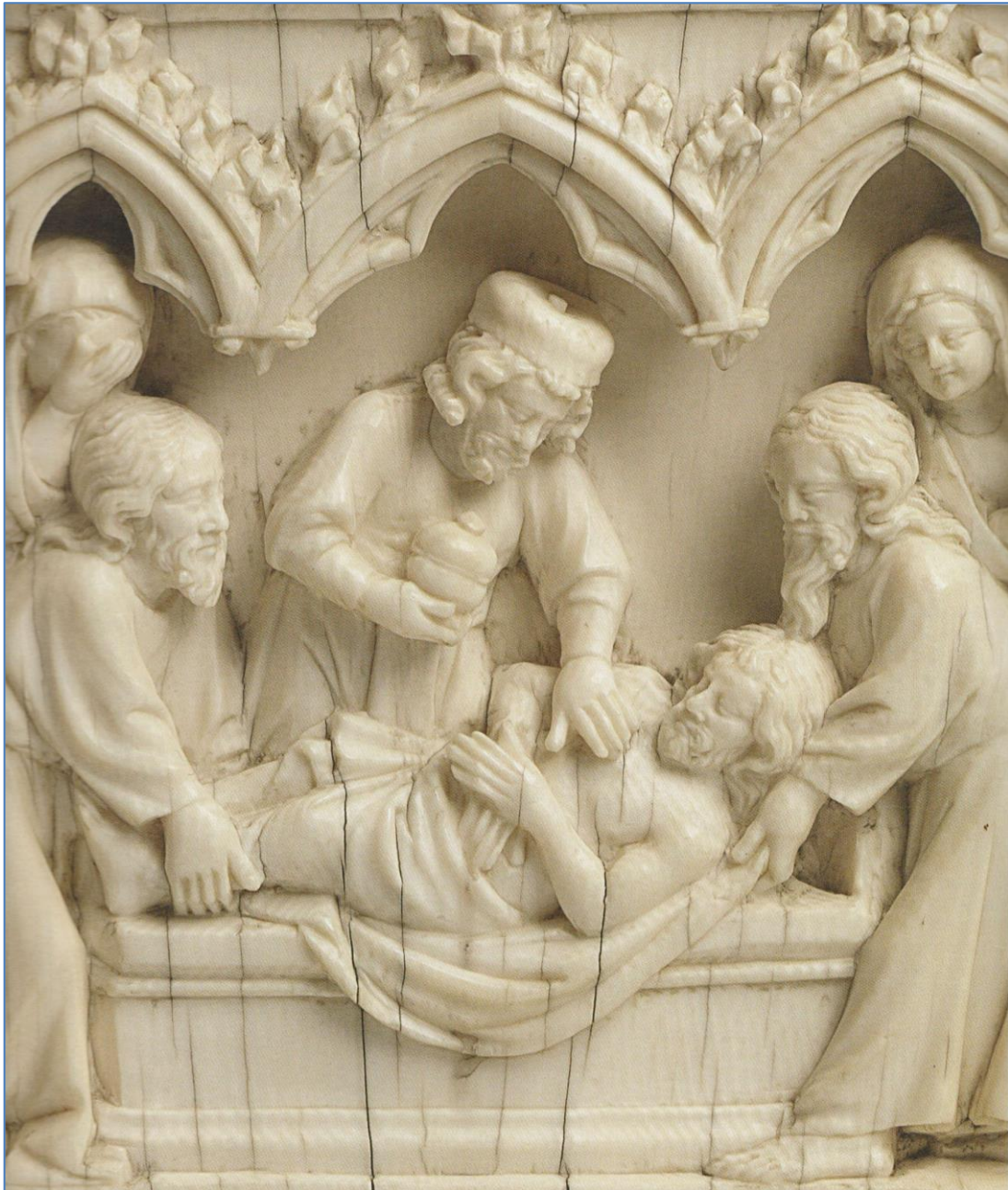
Figure 2 Detail anointing the body of Christ, cat. No. 12.

Of the camera lens is paired with the superb descriptive skills of the author, and excerpts from the catalogue would make a welcome addition to any course interested in teaching students how to describe subject and iconography. Evocative phrasing like the billowing