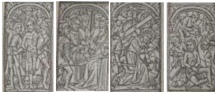
Figure 3 Casket, Burgundy/Flanders c. 1450-1500

While the connection to these printed images does not guarantee Parisian production, as these illustrations traveled and became models for artists across the globe, given the presence of large scale ivory workshops in the city c. 1500 we at least need to consider the French capital in our discussion of provenance for objects like no. 20. These kinds of associations based on localized models, of course, need to be taken with sizable grains of salt. The Creation of Eve and the Annunciation panel (no. 21) deftly provides that cautionary specimen. Stylistically linked to France of the Late Flamboyant period,