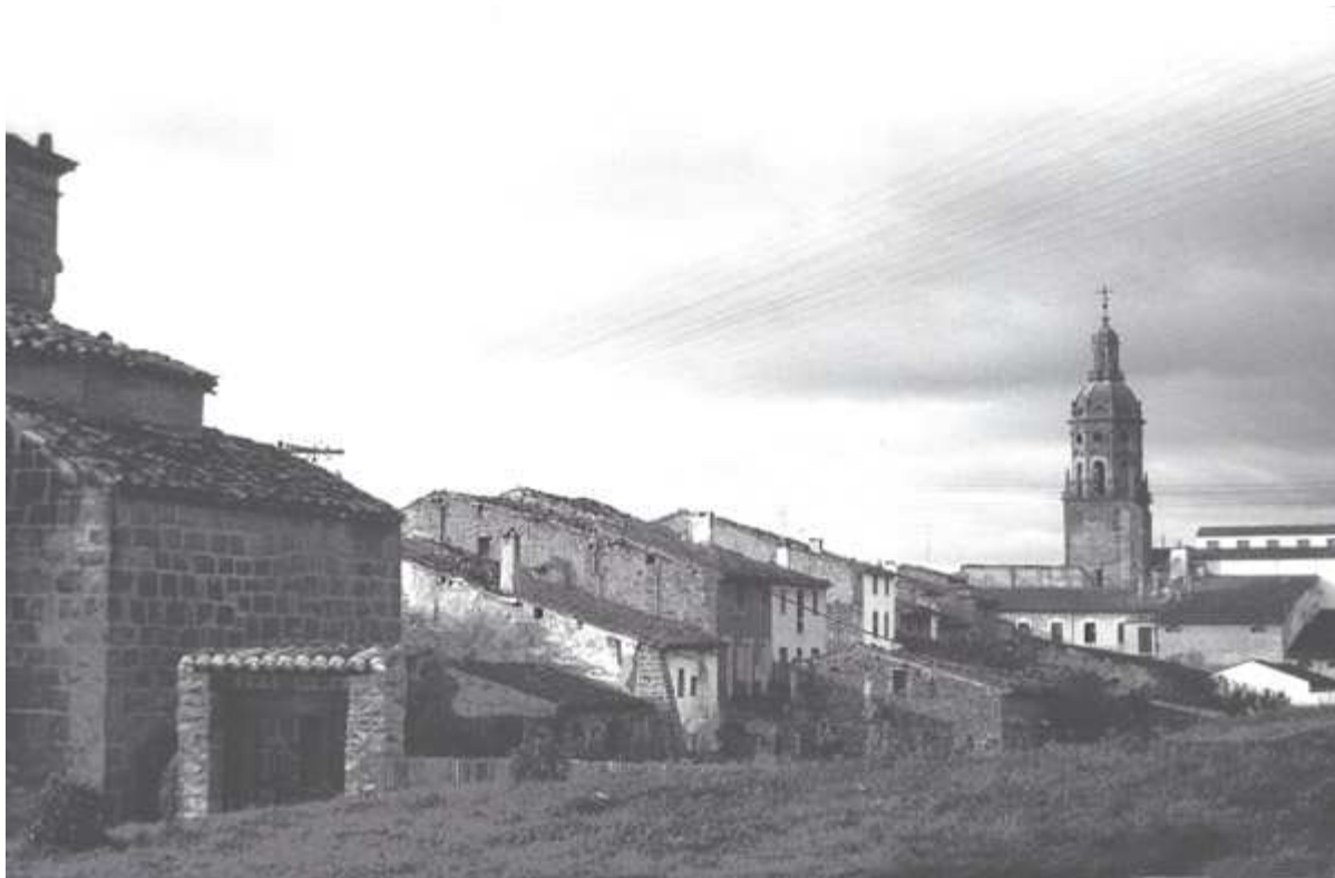
The town of Puente la Reina Puente la Reina, Spain